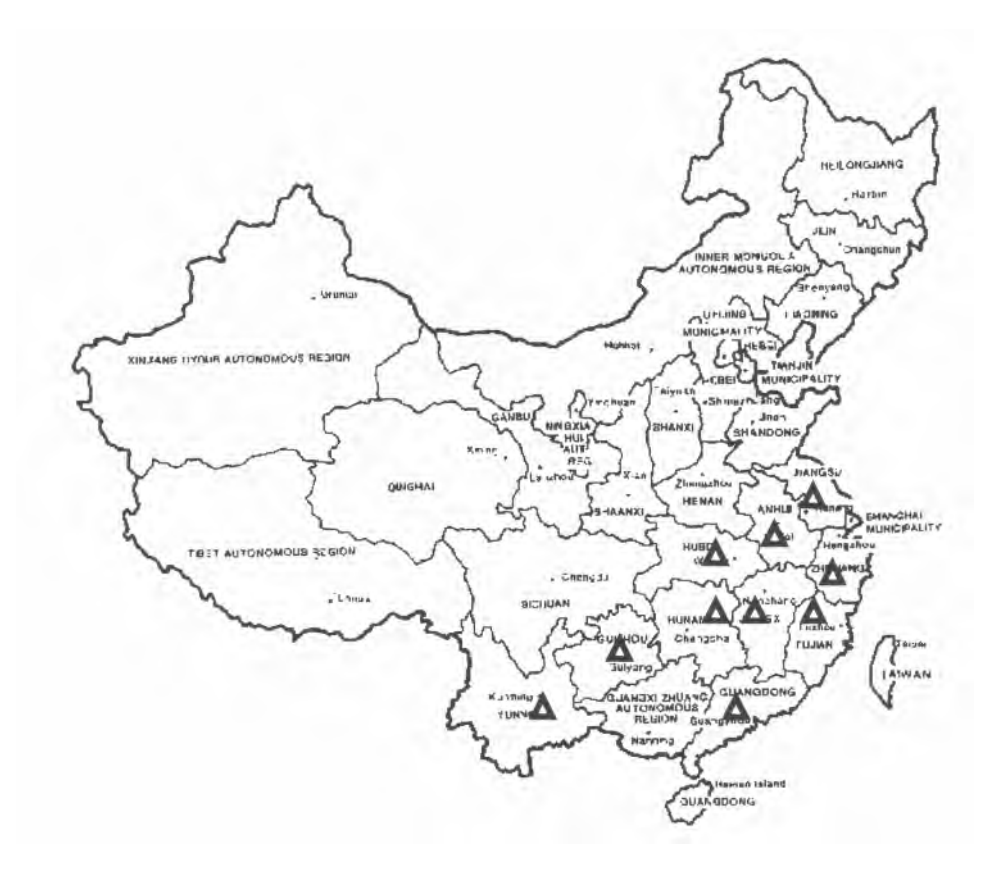
Figure 1. Eighteen seed sources of C. acuminata were collected from 10 provinces south of Yangtze River. Provenance tests were conducted in Huzhou City, Zhejiang Province, China.