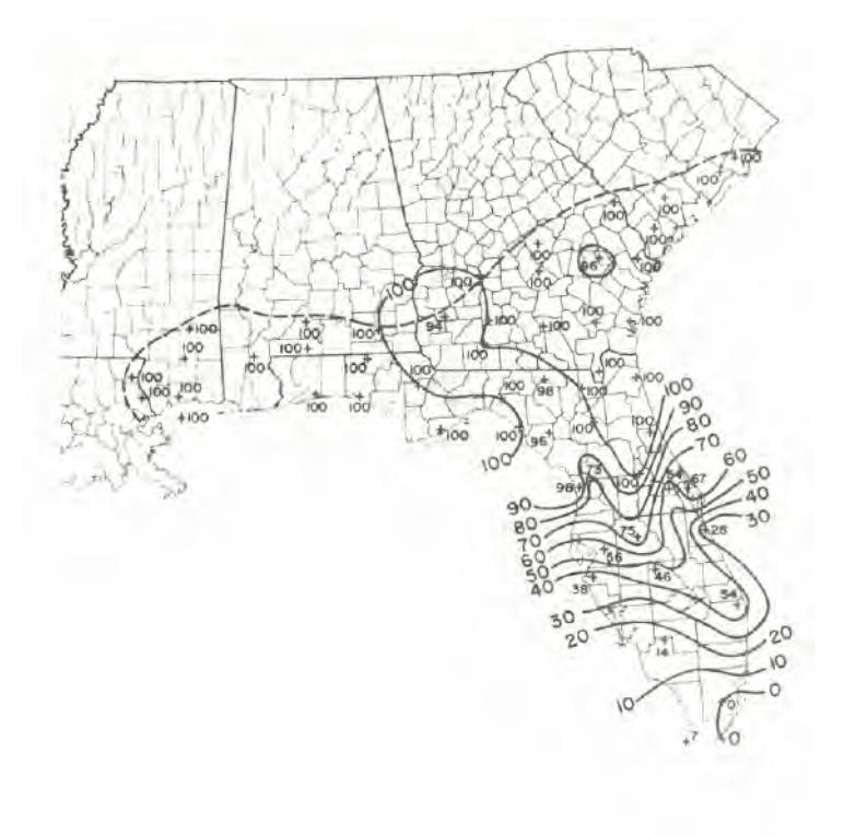
Figure 3.--Percent of trees having high myrcene (From Gansel and Squillace, 1976).

Figure 2.--Percent of trees having high \ensuremath{\texttt{B}}\xspace -pinene (From Gansel and Squillace, 1976).