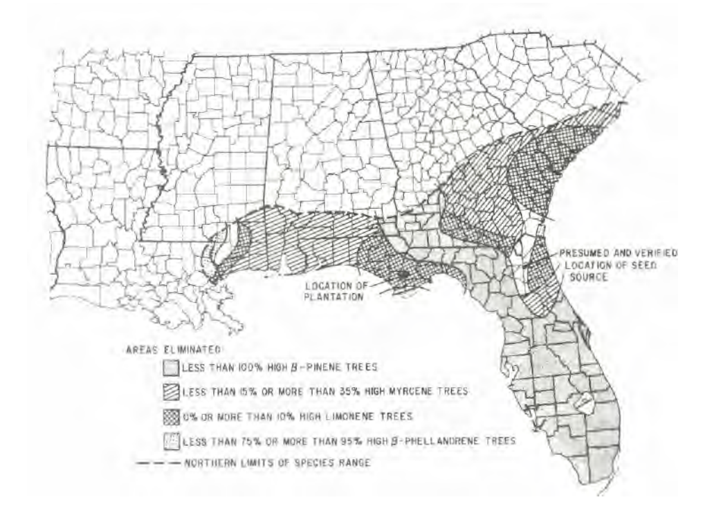
Figure 6.--Determination of probable origin of seed in a 40 year old slash pine plantation. (See table 3)