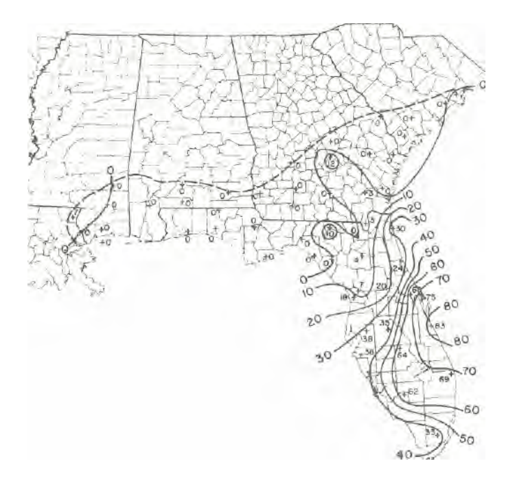
Figure 5.--Percent of trees having high \ensuremath{\texttt{\beta}} -phellandrene (From Gansel and Squillace, 1976).

Figure 4.--Percent of trees having high limonene (From Gansel and Squillace, 1976).