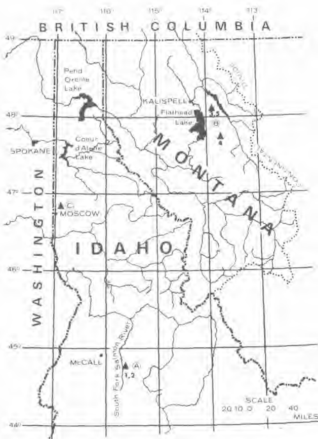
FIGURE 1. — Location of the three geographic areas and groups of trees within areas from which samples of Douglas-fir oleoresin were obtained. The areas are: (A) Salmon River in Valley County, Idaho; (B) Flathead Lake in Lake County, Montana; and (C) Moscow Mountain in Latah County, Idaho.

Monoterpenes were tentatively identified by comparing relative retention times of the unknowns with those of known compounds- Identity was also determined by the addition of known monoterpenes to the plant samples to enhance the corresponding peaks- This procedure utilized both the polar polypropylene glycol column and a non-polar Apiezon-L column packing- Agreement between two such columns is considered sound qualitative determination- With Apiezon-L, temperatures were: injection port, 195 C; column, 135 C; detector, 195 C. Helium flow rate was 35 ml per minute. Monoterpene concentration was expressed as a percent of total oleoresin by use of standard curves relating peak area (disc integrator values) and monoterpene concentration- Because no curve was available for the unknown monoterpene, this component of the oleoresin was omitted in determining total concentrations of the monoterpenes.