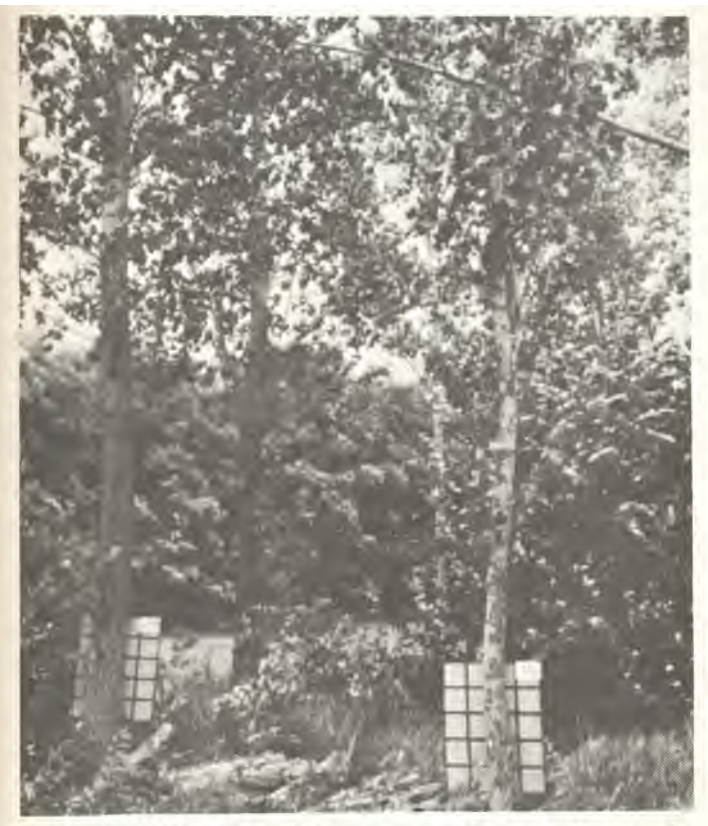
Fig. 2. NE-237 (left) was significantly larger in diameter than "Siouxland" (right) in the Horning planting in 1972. Broken tops such as in upper right of the photo are fairly common in all clones except NE-237.

Total height was very similar for all clones within each planting except for the poor showing of NE-273. The leader in diameter growth in both plantings was NE-237 (Table 2) (Figure 2). Significant differences in bark thickness, texture, and color were also noted (Table 3) (Figure 3). However, the bark of NE-273, "Siouxland," and "Robusta" were very similar in color, texture, and thickness.