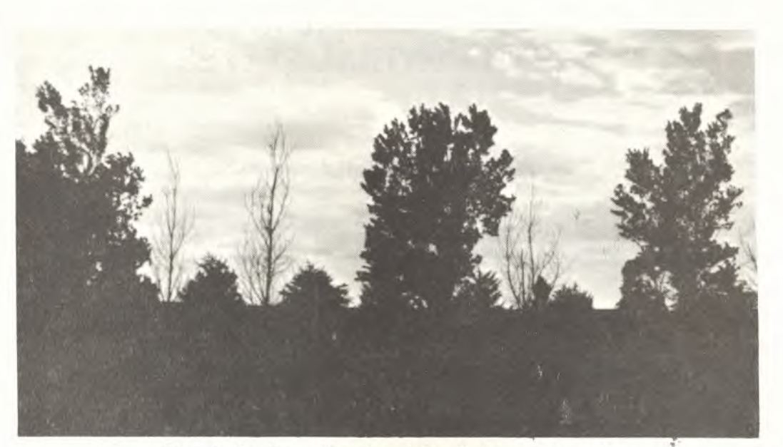
Fig. 5. Serious deterioration of the 12-year-old "Siouxland" cottonwood in this Lancaster County, Nebraska, windbreak first became evident at age eight.

since the first two seed crops produced by NE-237 have not been viable, it is possible that this clone will never produce seedling progeny. The seedless characteristic is desirable in plantings where natural reproduction is not wanted.