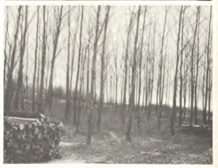
Fig. 1. The hybrid poplar planting at Horning State Farm was thinned to 12 \times 12 foot spacing after eight years.

<sup>1</sup>Published with the approval of the Director as Paper No. 2908, Journal Series, Nebraska Agricultural Experiment Station. Research reported was conducted under Project Number 20-28.