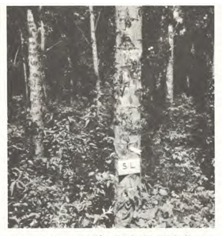
Fig. 4. Eleven-year-old "Siouxland" tree badly scarred by cankers.

At Horning State Farm, the "Siouxland" clone has been injured by cankers which covered about 50 percent of the bark area of the lower 12 feet of stem (Figure 4). Also, the crowns on most trees were deteriorating to the extent that they were becoming spike-topped. In the younger planting, less than 25 percent of the bottom 12 feet of stem of most trees of "Siouxland" and "Robusta" clones was covered with canker scars, both active and dormant. NE-273 at Mead was severely cankered within three years after planting.