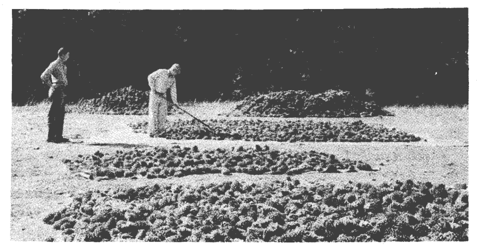
Figure 2. -Old method of spreading cones on canvas to dry. <u>Operation.</u> -The Tahoe National Forest has 8 drying racks. These are set up at White Cloud Fire Guard Station on the Bloomfield Ranger District about September 1 when cones begin to ripen.

Four sacks of ponderosa pine cones are poured into the top tray of each rack and spread out. Canvas or builder's paper keep dew off at night. Cones are rolled around with a stick about two times a day, as they open. Seeds drop through chicken wire into metal-bottom drawers. When cones are empty, drawers are pulled out and seed is poured into sack. Sacks are labeled as to species, seed zone, forest, and date. They are then ready to send to the nursery for dewinging and cleaning.