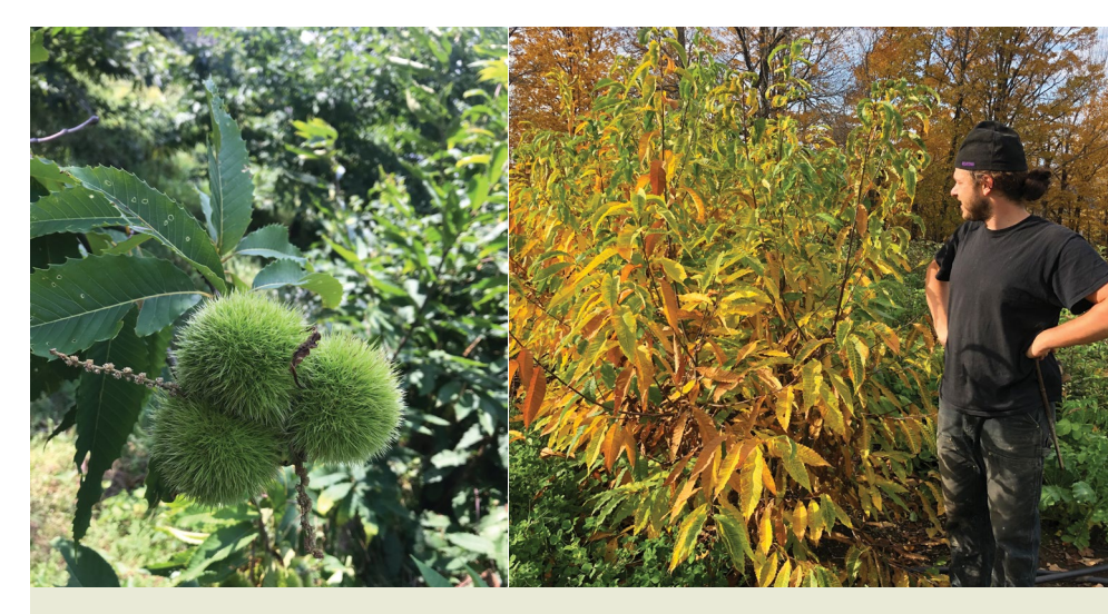
Figure 6. Chestnut ( Castanea spp.) burr (left) and hybrid chestnut seedlings (right), shown here at the East Hill Tree Farm nursery in Plainfield, VT, is an example of a plant being produced for agroforestry.

Propagative material may be grown at a nursery facility, in a seed orchard, or sown directly into the landscape (figure 6). Not all plant material is grown to be sold. A subset of