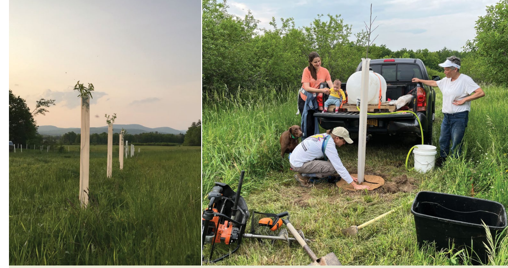
Figure 7. Improved willow ( Salix spp.) and poplar ( Populus spp.) trees were planted at Barred Owl Brook Farm (Westport, NY) to establish living fence posts that will restrict livestock access to the adjacent drainage channel (left). The trees will also provide shade and tree fodder for sheep in addition to myriad ecological benefits for wildlife (right).

After plants have been propagated, they must be integrated into agroforestry, restoration, or reforestation plantings (figure 7). The success of outplanting in an agroforestry