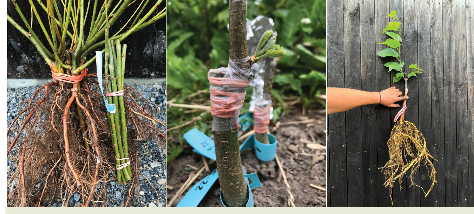
Figure 5. Cuttings, such as willow ( Salix spp.) (left), and grafted plants, such as honey locust ( Gleditsia triacanthos L.) (center) and mulberry ( Morus spp.) (right), grown at Barred Owl Brook Farm in Westport, NY, are common propagative material for agroforestry plants.

seed production) and breed plants that can be used for food production, the equipment, material supply chain, skill set, and labor needs differ from growing plants from seed. For example, hazelnuts can be propagated clonally through stooling, but there are production limits to this approach. Producing large numbers of clonal plants for commercial use requires the establishment of breeding programs, variety trials, and access to facilities such as tissue culture labs for clonal propagation.