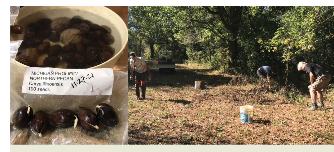
Figure 4. Northern pecan ( Carya illinoinensis [Wangenh.] K. Koch) seeds beginning to sprout (left). This variety of pecan was selected for its short growing season, cold hardiness, and culinary attributes. These unique characteristics come at a cost of $2.20/seed to the nursery grower. Seed collection and sourcing are important for agroforestry; here (right), workers collect black walnuts ( Juglans nigra L.) from mature, naturally established trees on a farm in Parks, AR.

Plant material may be generated from (a) stem or root cuttings, (b) tissue culture, or (c) seed (figures 4 and 5). Some species used in agroforestry systems may need to be clonally propagated or improved for commercial agricultural production. For example, if the goal of the agroforestry system is to produce a fruit crop such as pears ( Pyrus spp.) or black currant ( Ribes nigrum L.), the parent plant is often a cultivated variety that reliably produces a consistent, robust crop. To clonally propagate (through tissue culture, grafting, cuttings, or carefully controlled