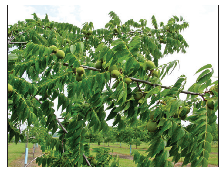
Figure 7. This abundant black walnut fruit crop is maturing on a grafted tree in a seed orchard.

Black walnut's high commercial value has led to decades of research on genetics and genetic improvement for artificial reforestation with this species (Beineke and Masters 1973, Mckenna and Coggeshall 2018, Mckenna and O'Connor 2014, Michler et al.