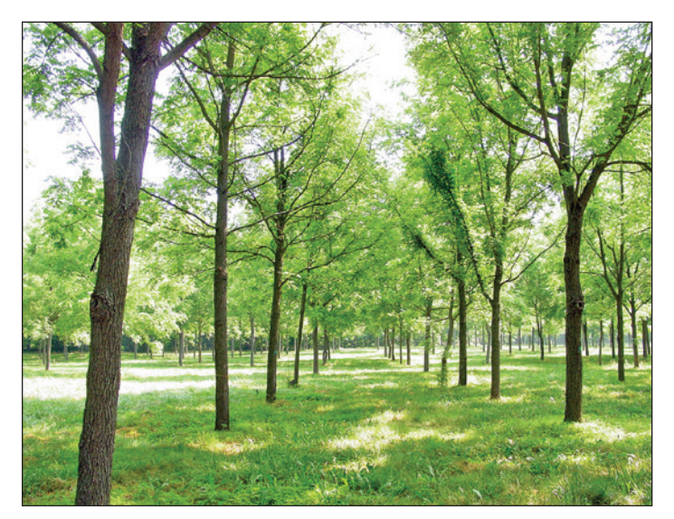
Figure 1. A plantation of black walnut managed for future timber requires intensive care to ensure that it will thrive.

Black walnut's darkly colored bark and deep fissures distinguish it from the lighter gray bark plates of butternut ( Juglans cinerea L.) (Farlee et al. 2010).