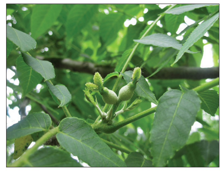
Figure 6. After pollination, the female flowers of black walnut will develop into a nut inside an outer husk.

The success of black walnut seed and pollen dispersal may be attributed to several factors including small mammals (mainly squirrels), hydrochory (i.e., nuts can float and move long distances on rivers), and high levels of wind-dispersed pollen movement. Genetic diversity of neutral alleles is lower in northern populations compared with southern populations, but these latitudinal-based differences account for less than 10 percent of genetic variation (Victory et al. 2006).