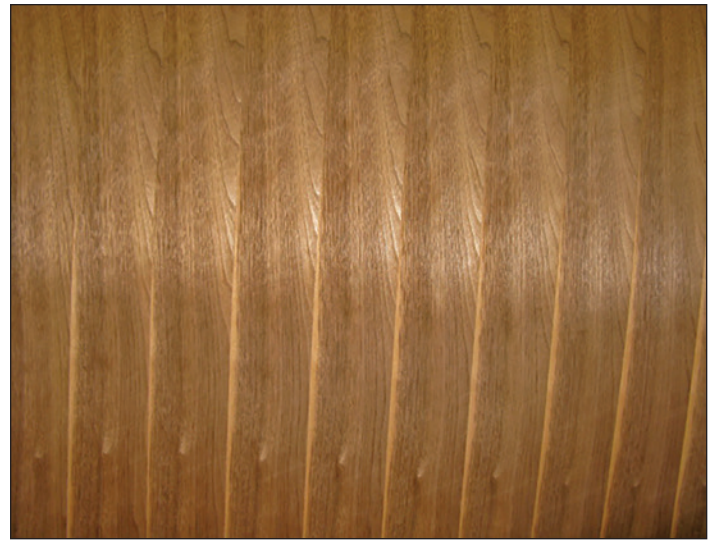
Figure 3. This veneer of black walnut is a good representation of a highly valued timber product from this species.