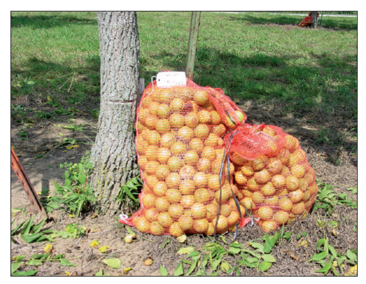
Figure 4. This large bag of black walnuts was collected from a seed orchard. Black walnuts are best picked from the ground rather than directly from the tree.

The phylogeny of the genus Juglans , which includes both butternuts and walnuts, is complex because it traverses multiple continents and is divided into three sections based on origin, but not present locality. For example, black walnut occurs in the Rhysocaryon section which includes all New World walnuts, while butternut is part of the Cardiocaryon section, which is otherwise entirely Asian (Aradhya et al. 2006a, b; Aradhya et al. 2007). Although they co-occur, butternut and black walnut cannot hybridize because of their distinct phylogeny. One glacial refugium, in the lower Mississippi Valley, is supported by the genetics of extant trees, with no