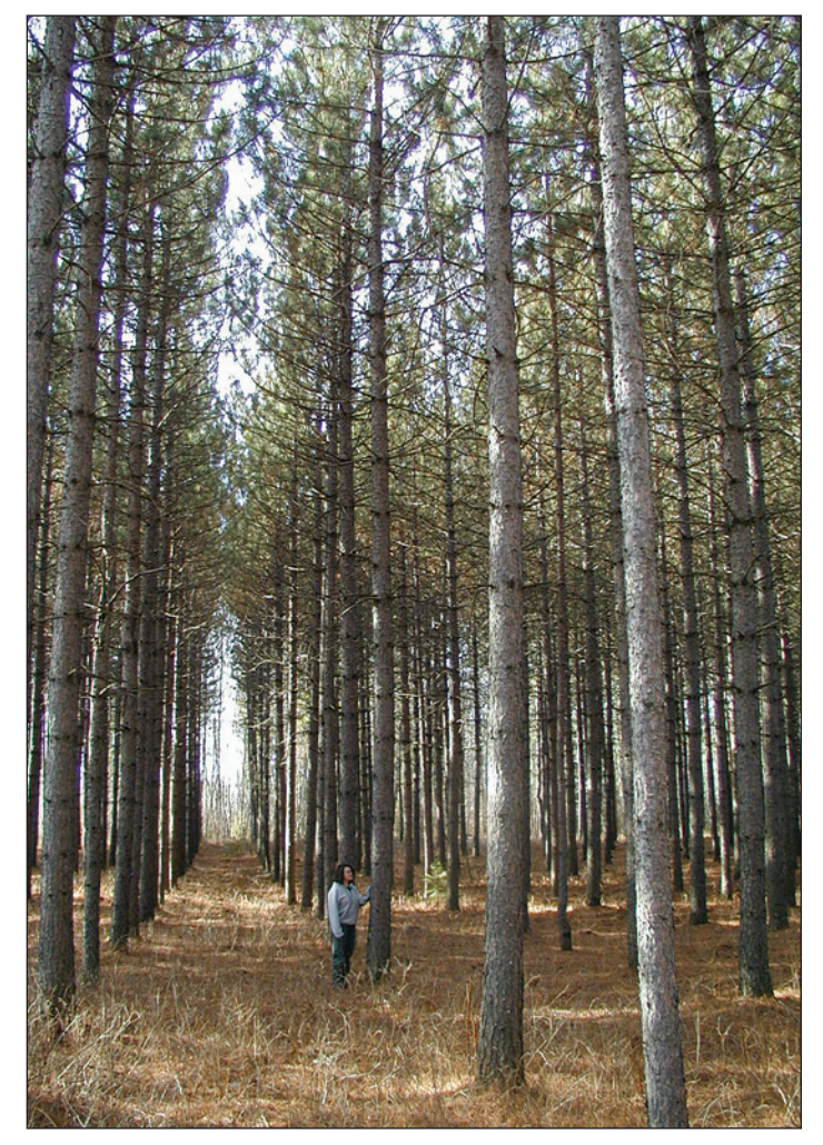
Figure 2. This rangewide red pine provenance trial at the Cloquet Experimental Forest in Minnesota is similar in appearance to the numerous planted stands of red pine in the Great Lakes region.

Natural regeneration of red pine is governed by its intolerance of shade and its seedlings' preference for bare mineral soil or mineral soil with a thin moss or litter layer (Rudolf 1990). Fire played a major role in determining red pine's distribution and persistence historically. Mature red pines are more fire-tolerant than jack pine or white pine (Hauser 2008), but its cones are not serotinous and seeds are destroyed by intense fire. Based on dendrochronology and analysis of fire scars (figure 3), most extant old-growth red pine stands are dominated by one or two age cohorts. Fires severe enough to remove some canopy trees, but not severe enough to eliminate local red pine seed sources, were probably involved in the origin of natural stands historically (Fraver and Palik 2012) while less severe, more frequent ground fires reduced hardwood competitors. Red pine is restricted to the least fire-prone sites in