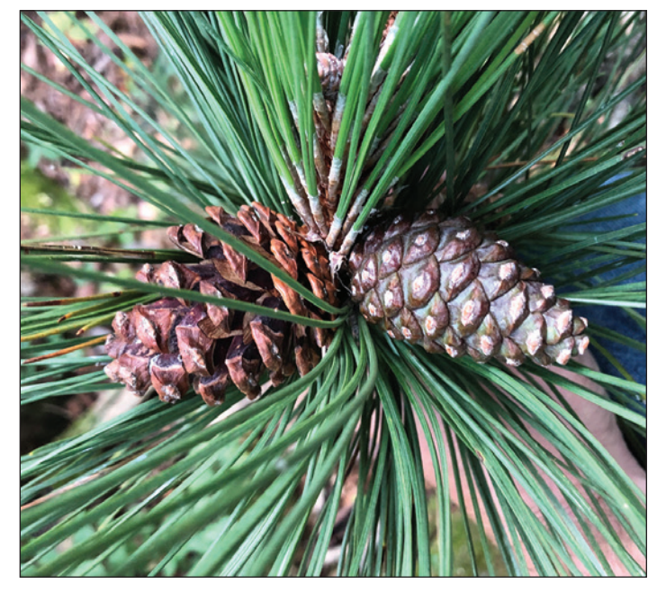
Figure 6. This red pine tree has one cone near opening (purple-brown color) and a second already open with seed release in progress in September in southwestern Wisconsin. Cones at the closed and mostly brown stage are ideal to collect.

among provenances tends to be small if significant (Lester and Barr 1965), and the same sources tend to perform best at different sites (Pike and David 2007, Wright et al. 1972). Red pine is projected to cope poorly with a changing climate according to the Tree Atlas (Peters et al. 2020). Some investigators have found subtle variation in growth traits based