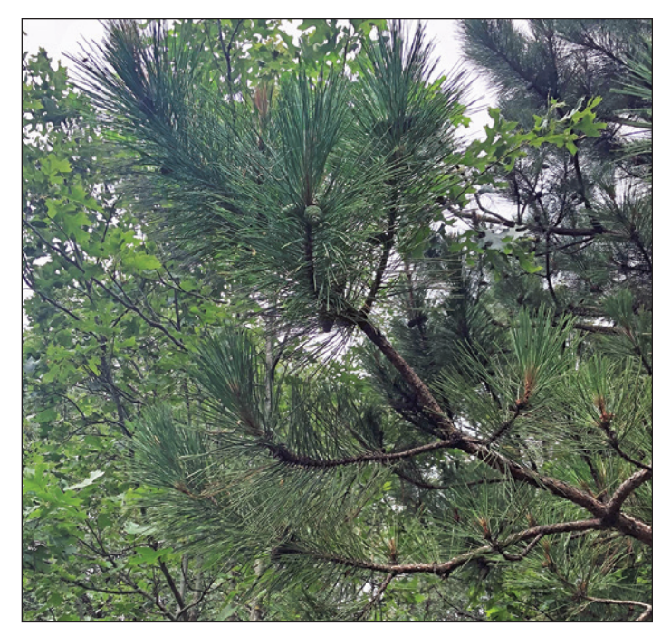
Figure 5. Second-year cones on this red pine tree are nearly ripe enough for picking.

among provenances tends to be small if significant (Lester and Barr 1965), and the same sources tend to perform best at different sites (Pike and David 2007, Wright et al. 1972). Red pine is projected to cope poorly with a changing climate according to the Tree Atlas (Peters et al. 2020). Some investigators have found subtle variation in growth traits based