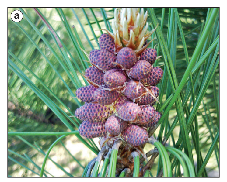
Figure 4. (a) Male and (b) female strobili of red pine in Minnesota.

Studies that measured performance of red pine seed sources did not find strong relationships between movement distance and performance, but sources from the Northeastern United States (New England States) consistently underperform compared with Great Lakes sources (e.g., Wright et al. 1972). Variation