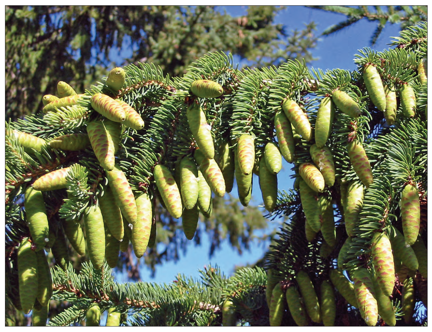
Figure 3. Immature cones ripening on a tree at a seed orchard. Unlike cones of the Pinus genus, spruce cones only require one year to develop. A cut test of the cone is required to determine ripeness. Once the cone dries, the seed is released in late summer.

effects are often insignificant and overshadowed by differences among trees within a provenance (Li et al. 1993). In other words, within any single provenance, trees with a variety of traits and habits can be found. White spruce is not known to hybridize with other Picea species in the wild. In summary, white spruce has high gene flow, high genetic variation, and greater differences among trees within a stand than among stands.