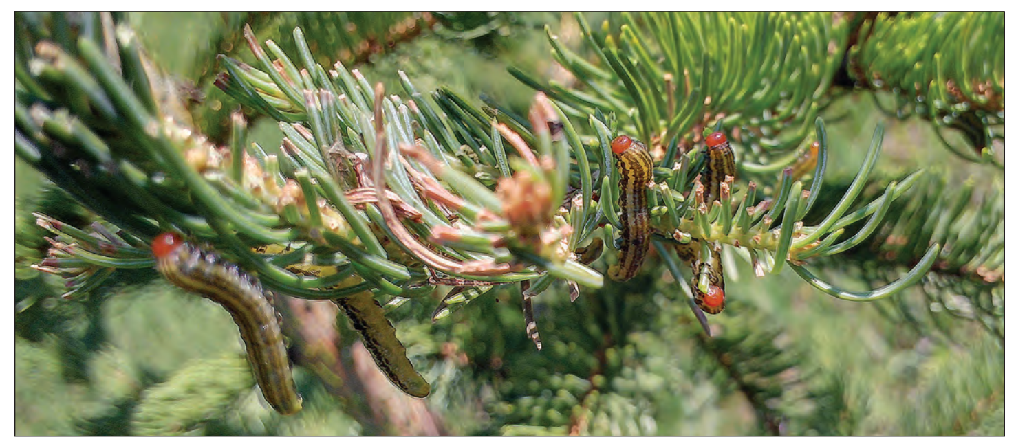
Figure 5. Yellow-headed sawfly is an occasional pest on white spruce foliage.

Other insect pests that affect white spruce include yellow-headed spruce sawfly, ( Pikonema alaskensis [Rohwer]) (figure 5) which can occasionally produce outbreaks (Katovich et al. 1995). Spruce budmoth ( Zeiraphera canadensis Mutuura and Freeman) and spruce spider mites ( Oligonychus ununguis [Jacobi])