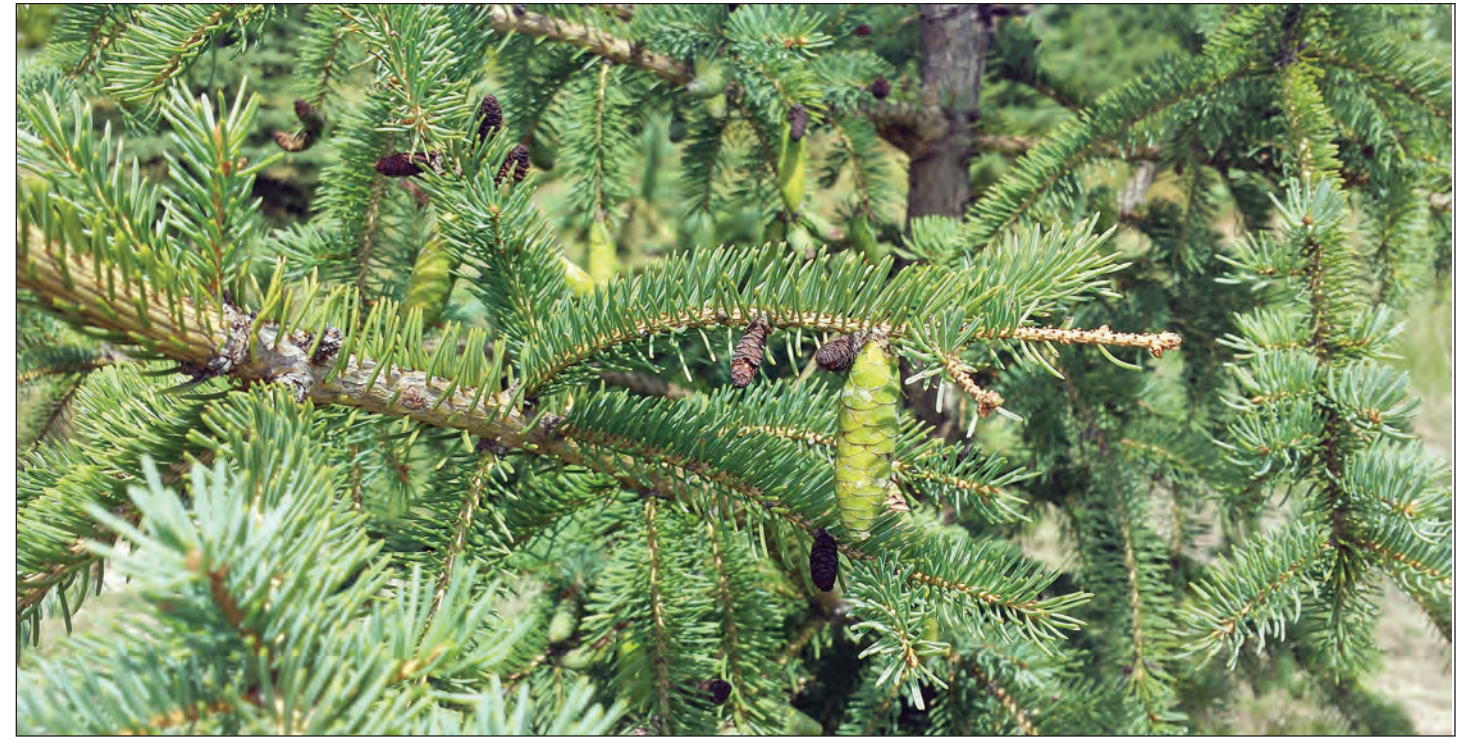
Figure 2. Spruce trees tend to leaf out earlier in the spring than other plants. Early spring frosts can damage female inflorescence (immature cones in photo) or developing shoots.

White spruce seeds are lightweight, winged, and rapidly released when cones dehisce, usually in August (figure 3). Cones ripen and mature in one growing season as opposed to cones of Pinus species that require two years to mature. Mobile seeds and wind-dispersed pollen contribute to high rates of gene migration (O'Connell et al. 2006), resulting in high genetic diversity across the species' geographic range (Furnier et al. 1991). Genetic variation is low among populations (stands) and reflects high rates of migration: F<sub>ST</sub> values (a ratio of genetic variation between sub-populations and the total population) range from as low as 0.006 to 0.007 (Cheliak et al. 1988, Namroud et al. 2008) to as high as 0.113 along the northern range edge in Québec (Tremblay and Simon 1989). This high genetic diversity confers a strong capacity to adapt to local conditions. Provenance (geographic origin)