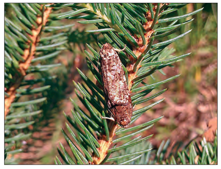
Figure 4. Spruce budworm is the most economically important pest of white spruce across North America. The adult form is shown in this photo, but most damage occurs from feeding by larvae. (Photo by J. Warren, USDA Forest Service, 2011)