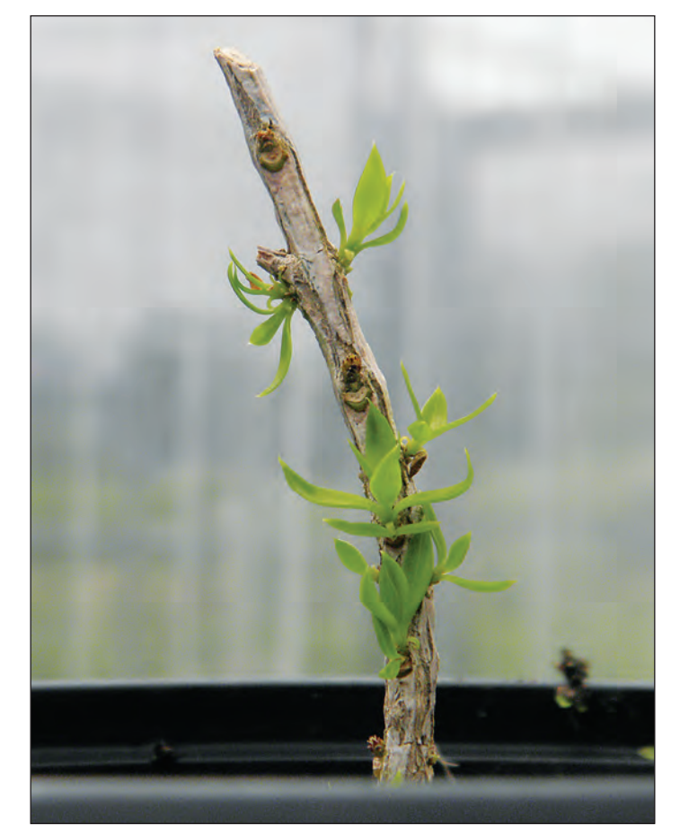
Figure 7. Only 14 percent of cuttings in the propagation trial put out new leaves.

We found that both the mist benches and the humidity tents gave the same results. Cuttings may put out new leaves (figure 7), but then die if they fail to initiate new