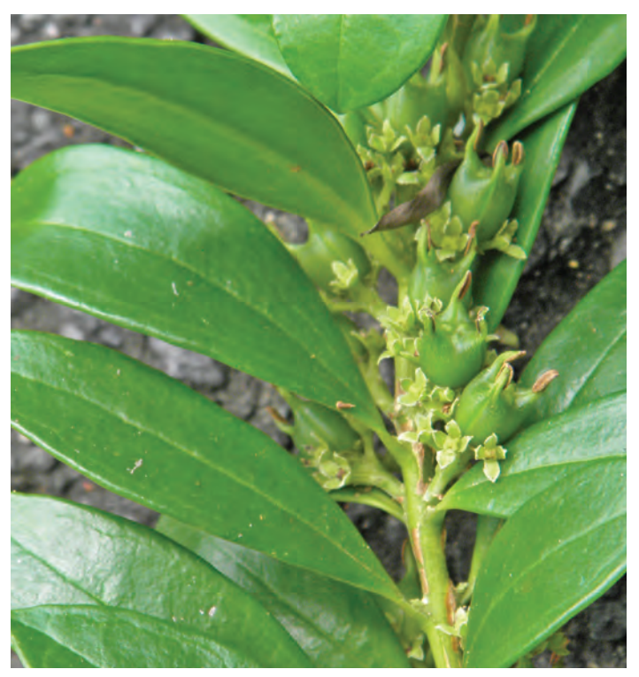
Figure 3. Seed capsules of Vahl's boxwood have 3 "horns" at the top of the capsule.

to reach 12 in (30 cm) in height until they are ready to leave the nursery. Once planted outside the nursery, plants grow less than 1 ft (30 cm) per year. Two trees planted in the UVI Agroforestry plot are currently 6 years old and 66 in (165 cm) tall. They were 24 in (60 cm) tall when planted in 2014. This growth rate is an average of 7 in (17.5 cm) per year (Morgan, personal observation). Architecture of Vahl's boxwood can be influenced by site (Castellanos et al. 2011).