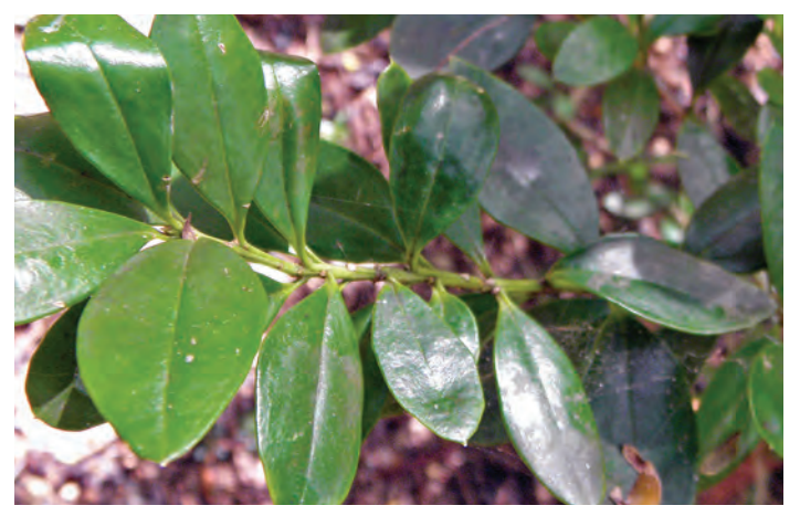
Figure 1. Foliage of Vahl's boxwood occur in an opposite arrangement.

Vahl's boxwood is a small tree or bush that has a maximum height of 15 ft (5 m). The bark is gray and finely fissured. The leaves are dark green, leathery, and stiff and are oppositely arranged on the branches (figure 1).