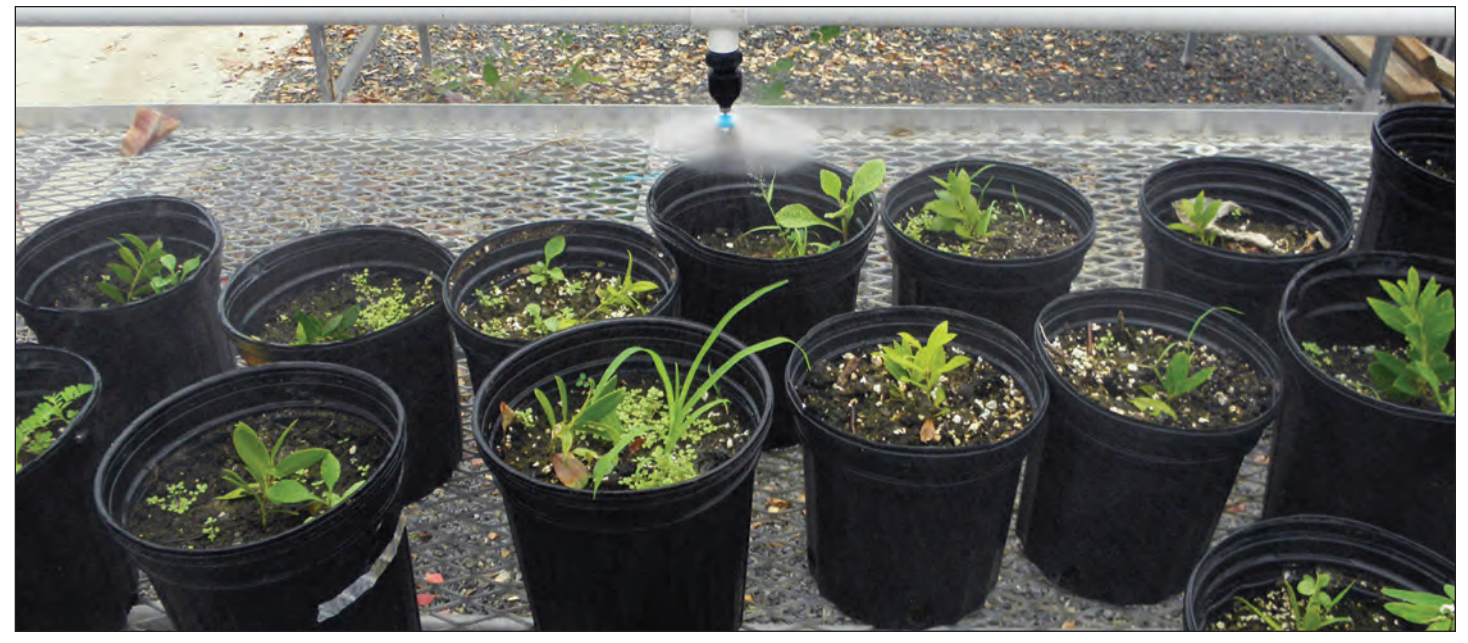
Figure 6. In a trial of vegetative propagation of Vahl's boxwood, cuttings were regularly sprayed by misting nozzles.