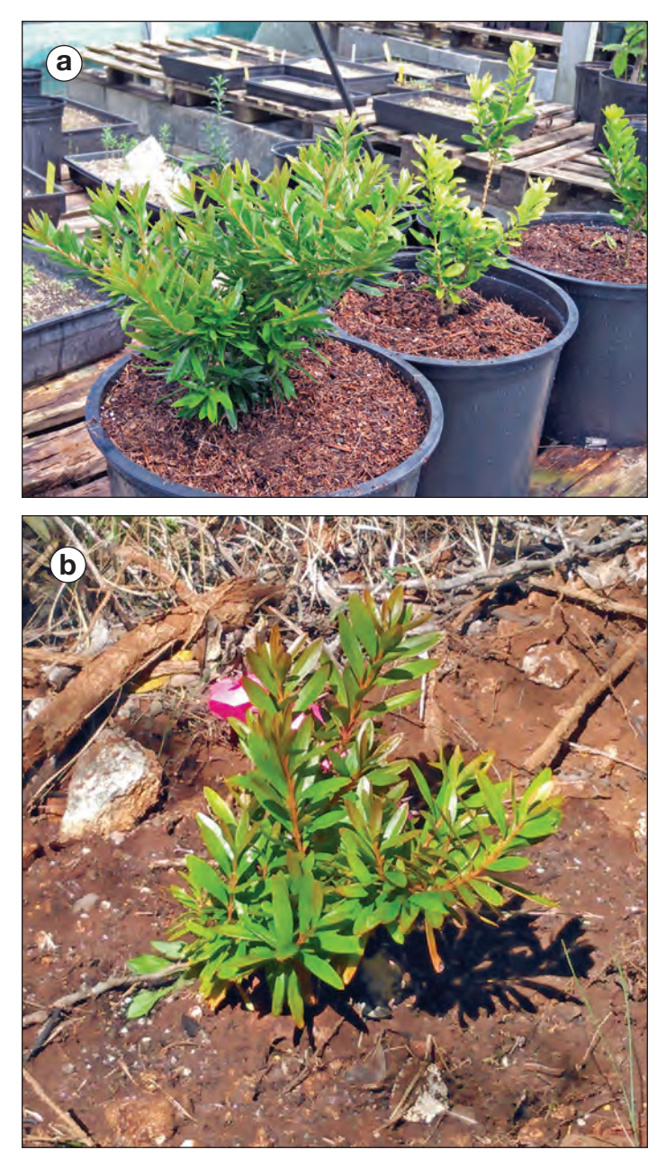
Figure 8. (a) Successfully propagated planting stock was (b) planted at Sandy Point National Wildlife Refuge.

roots. In our experiment, the cuttings that survived remained stunted, even if they developed roots and new leaves, and did not reach sufficient size to be planted outside the nursery. Thus, refinement of vegetative propagation techniques is still needed for Vahl's boxwood. A stronger concentration of IBA may be worth testing.