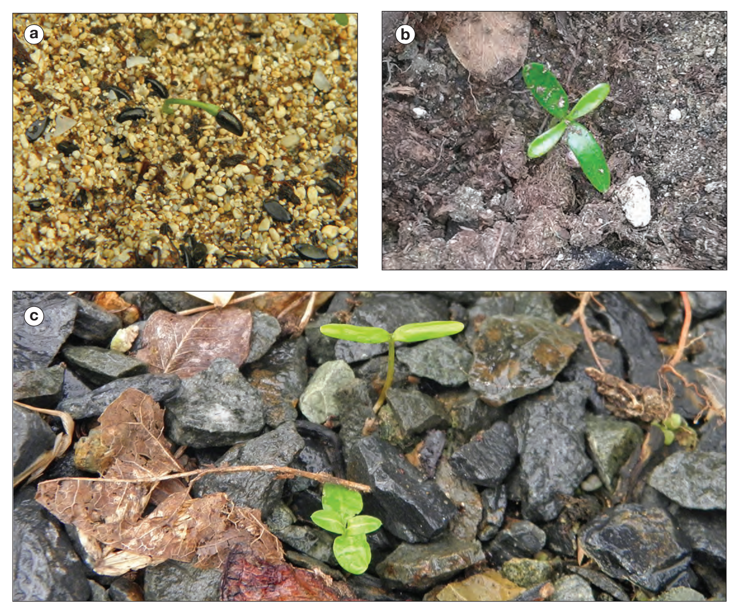
Figure 5. (a) and (b) germination progression of Vahl's boxwood can be slow and uneven. In fact, germination can be delayed significantly as shown by (c) seedlings that germinate over time on the greenhouse floor.

of roselle ( Hibiscus sabdariffa L.) which has a high rate of germination. Roselle, locally called sorrel, is an agricultural crop in the U.S. Virgin Islands. The swollen sepals of the roselle flower are used for making juices and teas. The viability percentages of Vahl's boxwood seeds from the three populations were 37, 23, and 14 percent, respectively. Most of the roselle seeds were viable. Notably, the roselle seeds were a bright pink compared with a pale pink observed in Vahl's boxwood seeds, hinting at a certain lack of vigor. Seeds germinated after 39, 60, and even 114 days after sowing. On occasion, lost and forgotten seeds will germinate years after planting in containers with other plants when old planting substrate was recycled, or even on the gravel floor of the UVI-AES greenhouse (figure 5c).