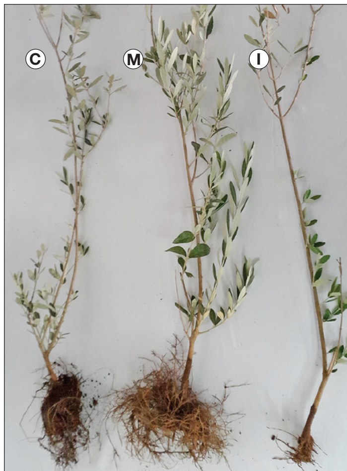
Figure 1. The effect of an endomycorrhizal inoculum on root and shoot development of olive plants; I: plant inoculated with Phytophthora palmivora , M: mycorrhizal plant, C: control plant.

Mycorrhizal inoculation had a positive effect on olive plant shoot morphology after 6 months of greenhouse cultivation (table 1). Plants inoculated with Phytophthora palmivora without the mycorrhizal inoculum showed disease symptoms of dieback,