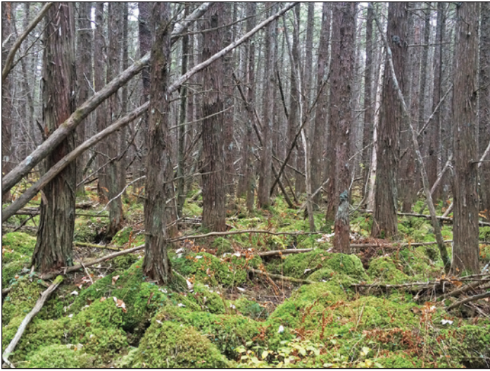
Figure 3. This pure stand of Atlantic white-cedar at Appleton Bog Preserve in Maine is the northernmost known population of the species.

available in the form of seed stores or seed orchards to support nursery production of genetically diverse and broadly adaptable planting stock.