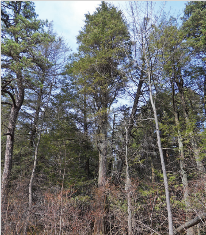
Figure 2. Growing at an elevation above 457 m (1,500 ft), this mature Atlantic white-cedar stand in the Kuser Natural Area at High Point State Forest in New Jersey is the highest known elevation population of the species.

mixed with other tree species including pitch pine ( Pinus rigida Mill.), slash pine ( P. elliottii Engelm.), pond pine ( P. serotina Michx.), eastern white pine ( P. strobus L.), eastern hemlock ( Tsuga canadensis [L.] Carr), baldcypress ( Taxodium distichum [L.] Rich.), water tupelo ( Nyssa aquatica L.), swamp tupelo/black gum ( N. sylvatica Marsh.), red maple ( Acer rubrum L.), and yellow birch ( Betula alleghaniensis Britton) (Little and Garrett 1990).