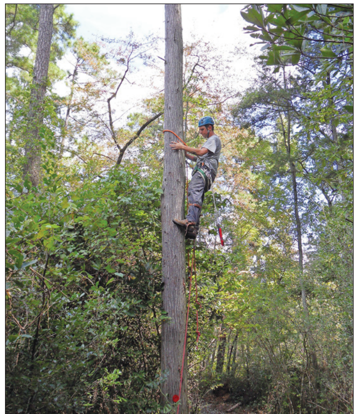
Figure 6. Andy Whittier of Camcore climbs an Atlantic white-cedar tree for seed collection at Jones Lake State Park in North Carolina.

The AWC gene conservation effort was conducted over five field seasons from 2012 to 2016. Collection efforts acquired seed from 255 mother trees and 33 populations well distributed across the entire geographic range of the species with multiple populations sampled within each of the four seed zones (table 2, figure 5). Best represented are the Northern and Southern Atlantic seed zones, with 78 mother trees in 9 populations and 108 mother trees in 13 populations sampled, respectively. Less represented are the Central Atlantic and Gulf Coast seed zones, where sampling was limited to 32 mother trees in 7 populations and 37 mother trees in 4 populations, respectively. Also represented in these