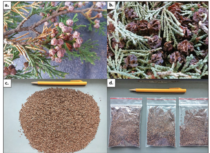
Figure 7. Mature seed cones of Atlantic white-cedar were (a) collected and returned to the Camcore lab in Raleigh, NC where they were (b) dried and allowed to open. Seeds were (c) separated from foliage and other chaff prior to (d) packaging for placement in cold storage.

Of the 1,049,648 seeds collected, 278,938 representing 236 mother trees and 33 populations are stored at the USDA Forest Service Ashe Nursery Facility for future use in seed orchard and restoration activities. An additional 85,872 seeds representing the same 236 mother trees and 33 populations reside at the USDA Agricultural Research Service