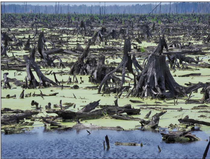
Figure 4. Severe wildfire damage to a population of Atlantic white-cedar at the Great Dismal Swamp National Wildlife Refuge.

Given AWC's historic decline, its patchiness across its distribution, its exacting site requirements, and growing public awareness of its importance, the species was recognized by the U.S. Department of Agriculture (USDA), Forest Service as a good candidate for genetic resource conservation efforts to support ongoing ecosystem restoration and regeneration efforts. In 2012, a gene conservation effort was initiated as a collaborative effort between Camcore (an international tree breeding and conservation program