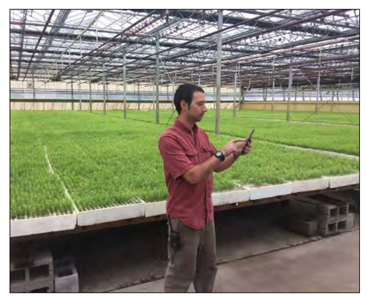
Figure 4. Scheduling irrigation inside one of the greenhouses using a mobile device.

Irrigation scheduling at our greenhouse is a full-time job. In the past, irrigators had to do a lot of walking through the crop and then walking back to a computer to schedule the irrigation. Now, irrigators have a tablet or smartphone that can turn on and set irrigation schedules as they walk around the greenhouse (figure 4). In addition, we are able to control irrigation applications using a cloud-based system. Opensprinkler (Rayshobby Shop, Amherst, MA, at http://www.rayshobby. net) is a Wi-Fi based irrigation controller that uses an app on a mobile device or Web site to set irrigation schedules and run programs (figure 5). It enables anyone with Wi-Fi or Internet access to instantly turn sprinklers on and off. The program includes the ability to input restrictions to prevent turning on more irrigation lines than the pump can support. Irrigation zones can be prioritized and put into a queue; the system will turn on the next irrigation zone when the current zone finishes. It has been a very valuable time saver and solved a lot of logistical and timing issues. The system is easy to set up and very inexpensive compared with a computer-based system and integrates easily with handheld devices and computers.