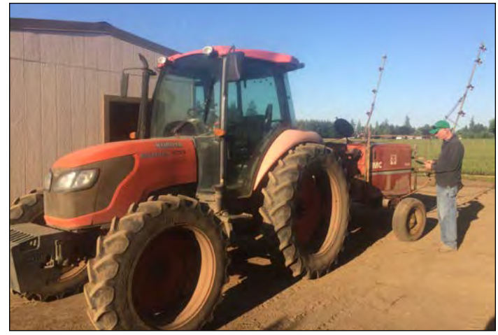
Figure 2. An equipment operator looking up fertilizer recommendations on his mobile device to see product and rate information and application location.

the treatment(s) and the amount of any chemicals they used. This system has enabled us to efficiently keep track of our chemical usage and have a running list of everything we have applied or have done to a given crop at the click of a button. Now, when we are out in the field with customers and they ask what has been done to their crop, we can immediately access a list of dates and activities for their crop on a mobile device. Also, when it is time to order more chemicals or fertilizers, the database provides an inventory of exactly how much chemical has been used in the past, thereby enabling us to accurately estimate future needs.