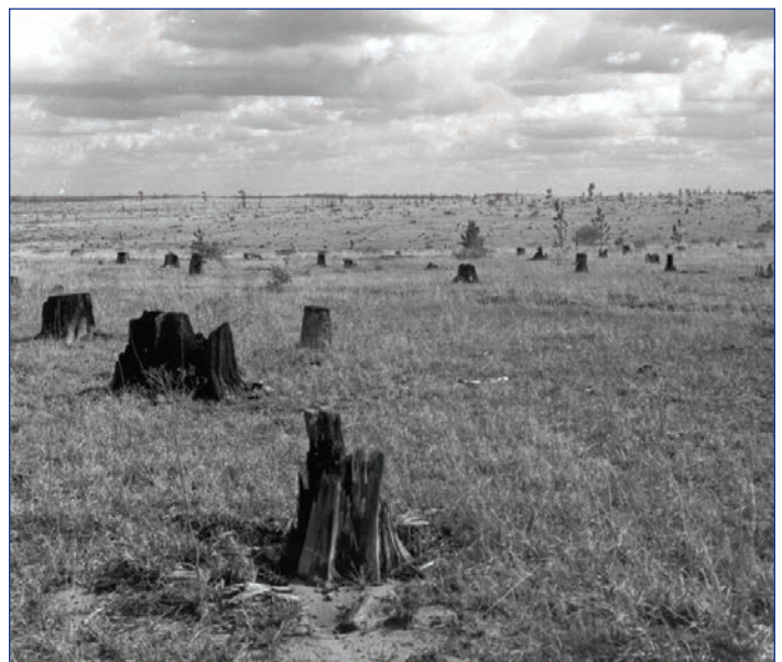
Figure 1. This cut-over forest land was typical of millions of acres of land across the South in the early 20th century.

Hardtner, Chapman, Cary, and other pioneers demonstrated that reforestation was economically viable. But, tree nurseries and technology to reforest these massive areas of depleted forest land were needed to successfully achieve reforestation goals.