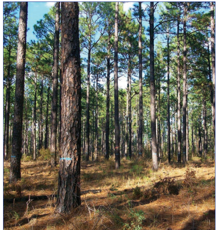
Figure 8. This longleaf pine plantation was established as a research study by Wakeley in the winter of 1934 to 1935.