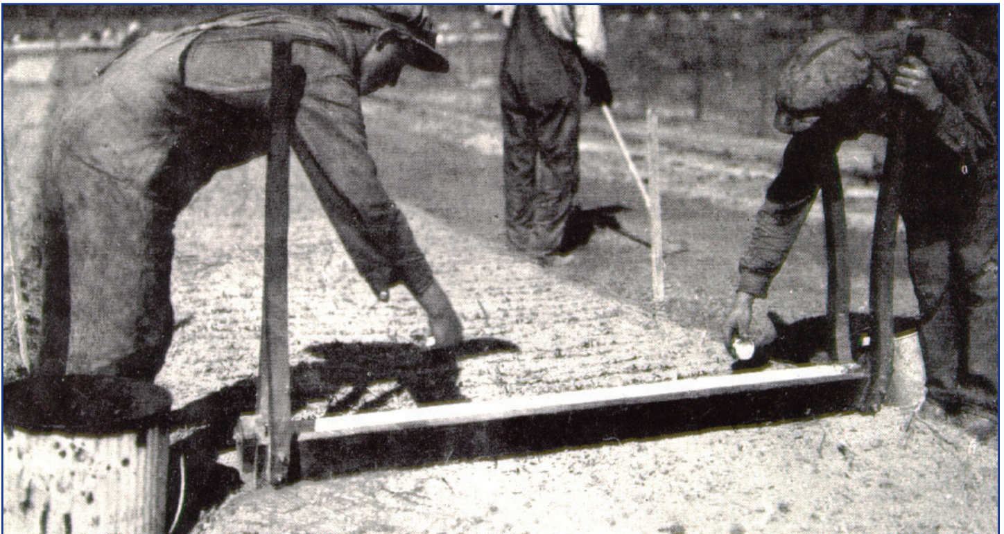
Figure 4. This seeder, which F.O. (Red) Bateman developed for winged longleaf pine seeds, exemplifies his innovative skill.

In 1933, the Stuart Nursery was established by the Kisatchie National Forest (KNF) in central Louisiana in conjunction with the creation of the Civilian Conservation Corps (CCC). Although KNF employees managed the nursery, a nearby CCC camp of 200 young men provided labor for its operation (figure 6). Nursery production was about 25 million seedlings annually, with most of the seedlings shipped to CCC projects that had reforestation emphases. Wakeley's research, now located at the nursery, took advantage of the CCC crews to apply a variety of nursery cultural practices and to establish