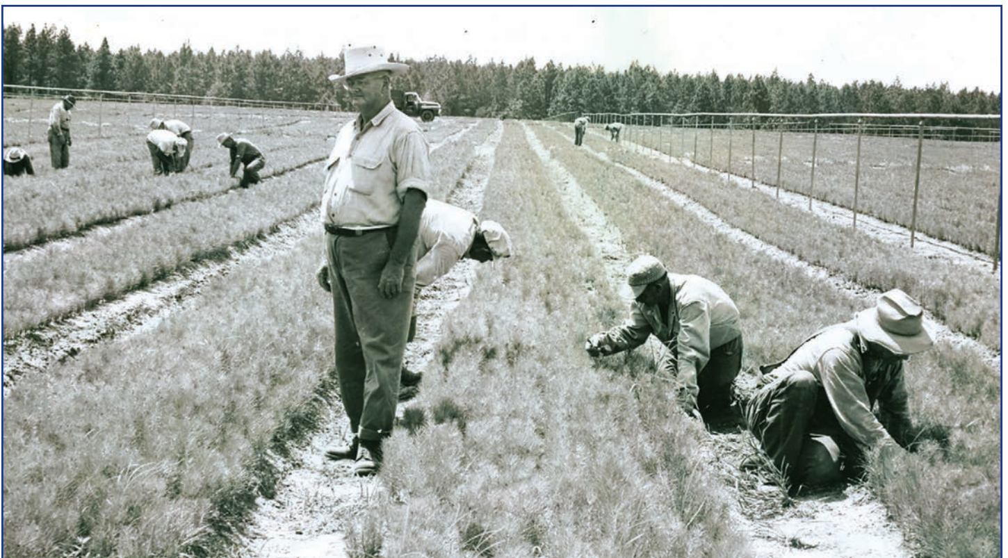
Figure 6. The Kisatchie National Forest's Stuart Nursery in central Louisiana used Civilian Conservation Corps crews to operate the nursery. These crews grew and planted 670,000 seedlings in research studies.