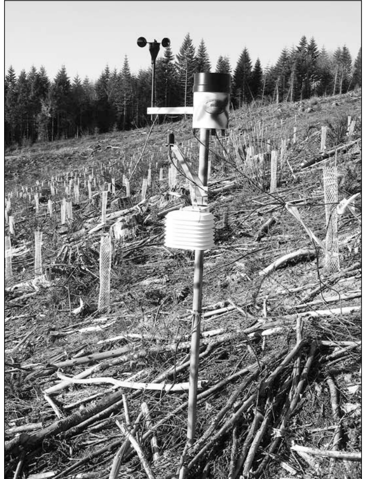
Figure 1. A weather station in the field.

As an example of the potential savings, the Vegetation Management Research Cooperative (VMRC) initiated five new study sites in 2006 and 2007. Each site had a centrally located weather station that included a rain gauge, an air temperature/relative humidity sensor, a wind speed indicator, and a light meter. Some manufacturers charge as much as $165 for a 6-ft (1.8-m) weather station tripod system. The weather station pole presented here cost less than half that amount, saving the VMRC over $445 during those 2 yr.