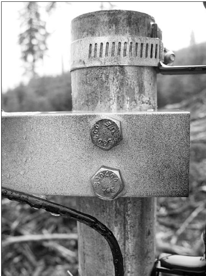
Figure 4. Wind speed arm attachment point.