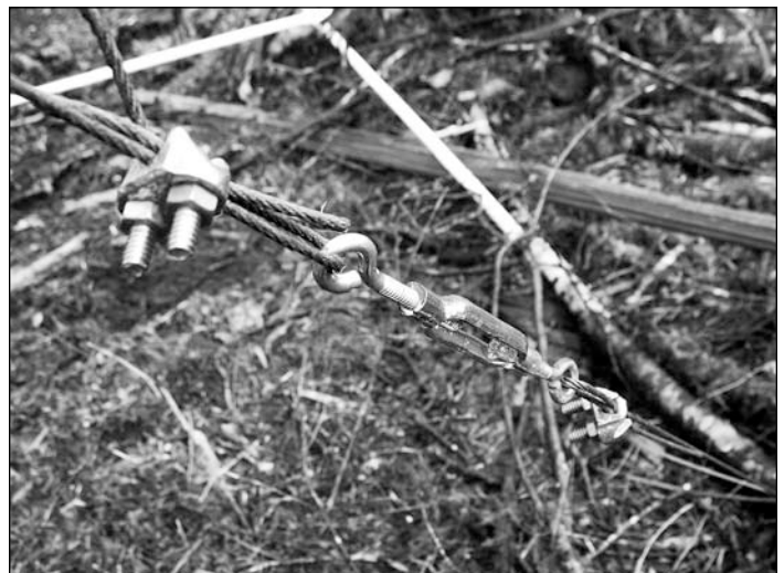
Figure 6. Turnbuckle attachment.