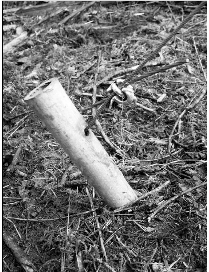
Figure 5. Stake attachment.