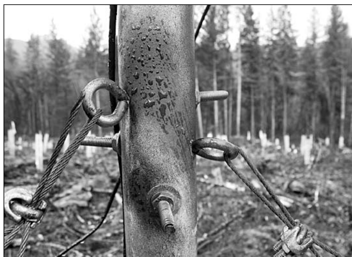
Figure 3. Guy wire attachment.