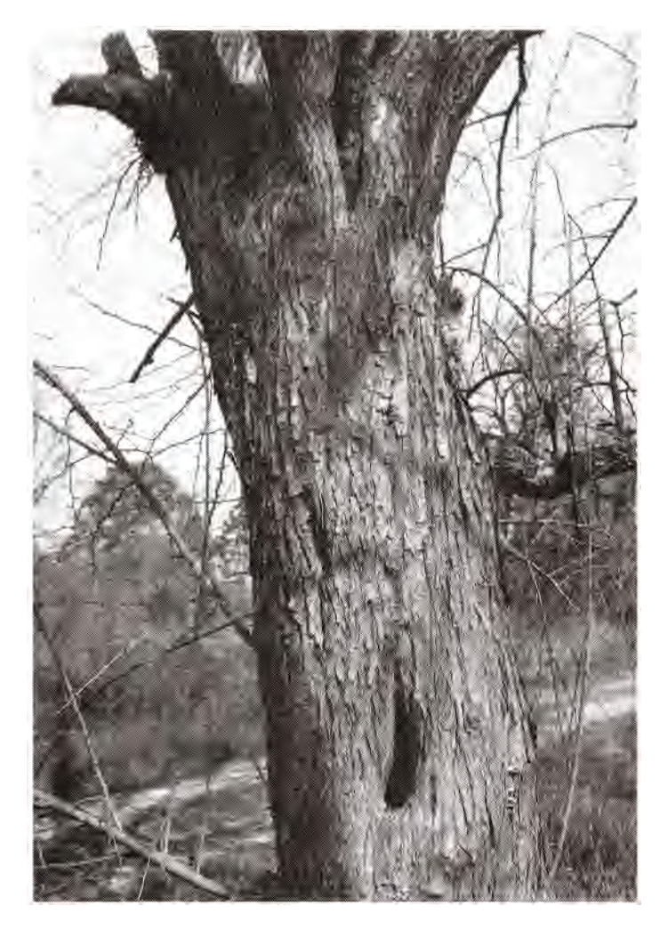
Figure 5—Typical bole of an Osage-orange tree showing crookedness and defects common to the species.

orange seeds and seedlings ended. However, barbed wire still required posts, which the Osage-orange hedges provided.