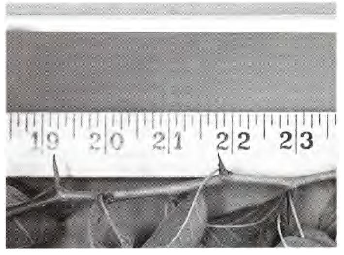
Figure 3—Thoms occur in the leaf axils on fast-growing 1-year-old shoots in full sunlight (scale in inches).

Smooth wire was used as fencing by many farmers, but it was made of iron, which rusted rapidly and was