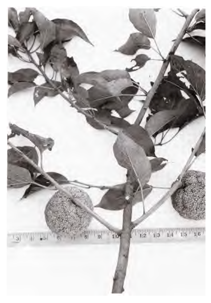
Figure 4— Ripe fruit (scale in inches).

Living fences. As a living fence, Osage-orange was a notable success when well established and properly cared for. Although failures were more frequent than successes, it was still the best option available at the time. Well-informed proponents of hedging had from the beginning emphasized the care needed: site preparation, viable planting stock, proper planting, an artificial fence to protect the young Osage-orange hedge during the first 3 to 4 years, protection from prairie fires, cultivation for 3 years, and trimming every year. Cutting back to 5- to 6-foot (1.5- to 1.8-m) height forced additional branch development at the base of the plant. The long-tough, thorny branches were then interwoven to make an impenetrable wall, and all invading woody plants, principally hackberry (Celtis spp.), were removed. The width of the hedge usually was maintained at about 4 feet at the base and 2 to 3 feet at the top. Thus trimmed, a hedge excluded livestock but did not obstruct the view of the landscape.