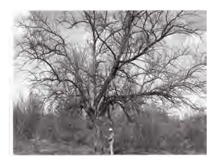
Figure 2— Mature Osage-orange trees typically have short, curved boles and low, widespreading crowns. Even in closed stands on good sites, less than half the stems contain a straight log that is 10 feet (3 m) long, sound, and free of shake. This open-grown tree stood in a pasture near Bastrop, LA, in March 1971.

struct rail fences and temporary dwellings. Immigrants arriving later found no available timber. Unregulated grazing of the public lands by herds of cattle ar feral hogs was widespread (Lewis 1941). Any land not enclosed was treated as commons, regardless of the ownership. The fencing problem of the 19th century was general and traumatic; its severity and the depth of feelings it engendered are difficult for late 20th-century Americans to imagine.