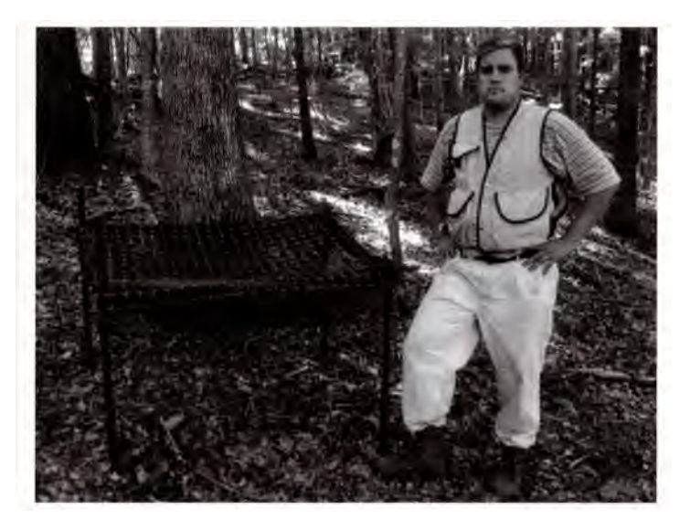
Figure 2—Fully assembled seed trap.

sides. Three edges of the security fencing are attached to the sides of the basket with 2 zip ties per edge. The overhanging fourth side of the security fencing is left unattached to allow easy access for seed removal, while still providing reasonable security from seed predators (figure 2).