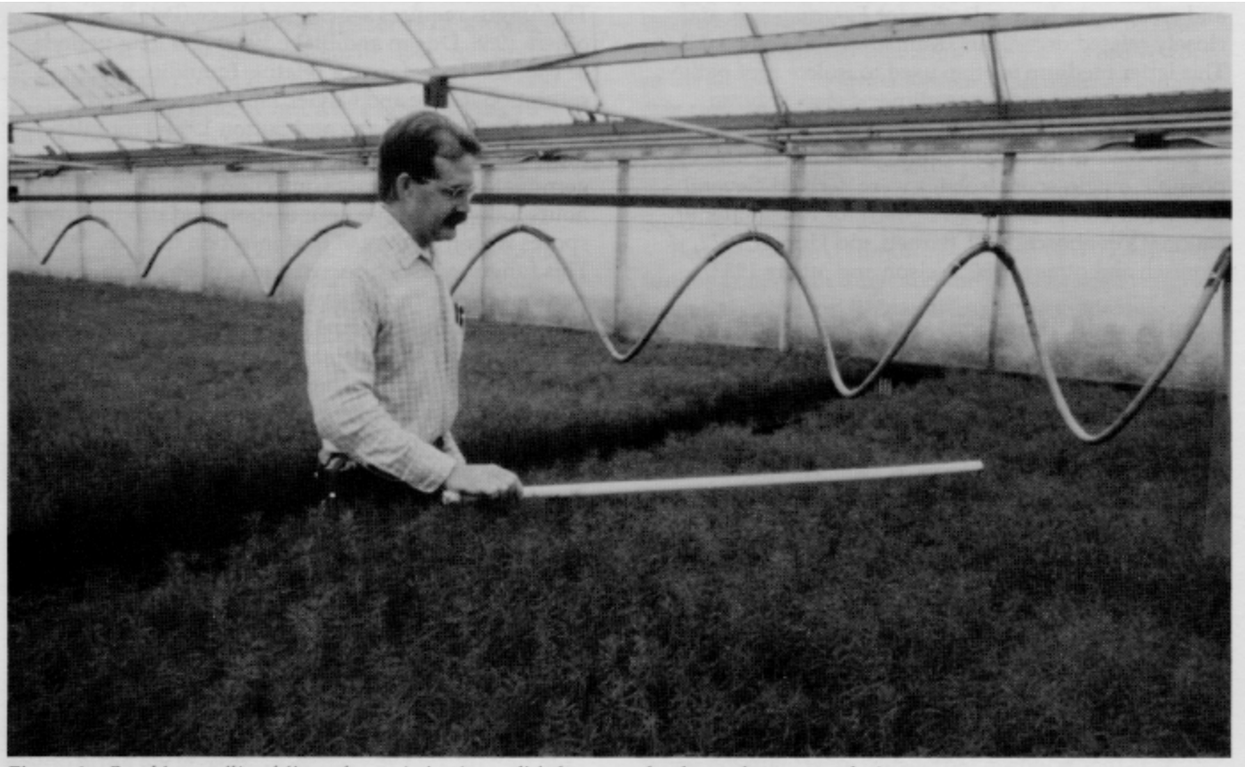
Figure 2—Brushing seedling foliage after an irrigation to dislodge water droplets and encourage drying.

that result in areas receiving excessive irrigation (Landis and others 1989b). Reducing irrigation frequency, irrigating early in the morning, and adding a surfactant to water reduces the time seedling foliage is wet, thus reducing conditions favorable to Botrytis infection (Sutherland and others 1989, Landis and others 1989a, Srago and McCain 1989, Dumroese and others 1990). Seedling foliage can also be brushed with plastic pipe or a wooden dowel to dislodge water droplets and encourage drying (figure 2). Besides reducing water necessary for spore germination and infection, reducing irrigation frequency would also help limit spore dispersal within greenhouses. Hausbeck and Pennypacker (1991) found that any cultural activity, especially irrigation of plant foliage, resulted in significant Botrytis spore dispersal. Other useful cultural controls include underbench ventilation and heating (Peterson and Sutherland 1990), growing seedlings at lower densities, spreading containers of susceptible species apart during periods of high seedling vulnerability (Landis and others 1989a), manipulating fertilizer regimes to maintain proper seedling size (Dumroese and others 1990), avoiding excessive nitrogen fertilization (Kingsbury 1989), and