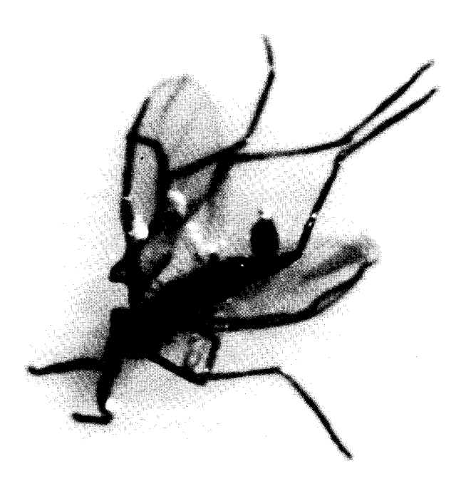
Figure 1 —Adult fungus gnat (Bradysia sp.) as it appears on a yellow sticky card.

media in the laboratory. Standard potato dextrose agar and an agar medium selective for Fusarium spp. and closely related organisms (Komada 1975) were used. This latter medium is often used to isolate root pathogenic fungi from conifer seedlings. Selected fungi emerging from trapped fungus gnats were maintained in pure culture for identification purposes. Whenever possible, single-spore isolates were derived. Several taxonomic compilations were used for fungal identification (Dorenbosch 1970, Barnett and Hunter 1972, Domsch and others 1980, Nelson and others 1983).