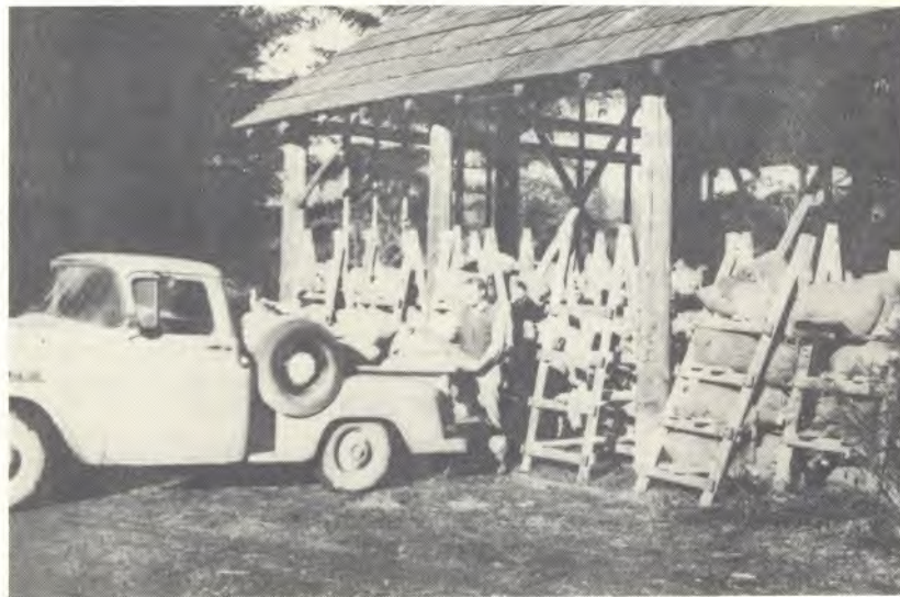
Wind River portable cone rack in use