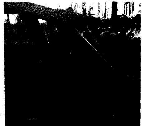
Minnesota pusher plow ahead of a TD-9 tractor. Planting machine is pulled behind tractor at the same time.