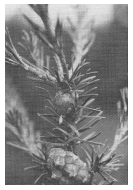
Figure 2.—First-year nodule of northern pitch twig larva.

Plots for chemical treatments consisted of five lodgepole pine trees (1.0 to 2.5 m tall and 2.5 to