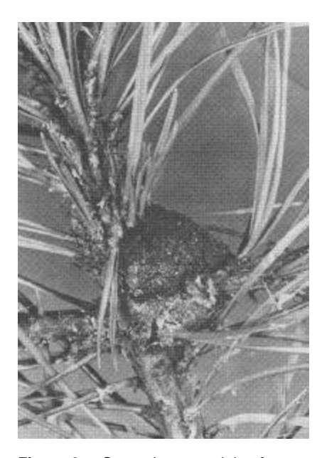
Figure 3.— Second-year nodule of northern pitch twig larva.

5.0 cm basal diameter) in a random block design. Each treatment was replicated in two plots, with two similar control plots receiving no treatment. In early spring, seven insecticides with systemic activity (table 1) were placed in holes dug within the crown dripline at the base of each tree. Application was at the rate of 5.6 milliliters active ingredient (a.i.) per centimeter basal diameter for emulsifiable concentrates and 4.5 grams a.i. per centimeter for granular forms. Treated plots were watered soon after application to help dissolve the chemicals for absorption by the root sys tem. All treated and control plots were examined before