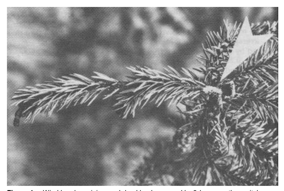
Figure 1. —Wind breakage injury and dead leader caused by 2d-year northern pitch twig larva.

The northern pitch twig moth (Petrova albicapitana (Busck) attacks jack pine (Pinus banksiana Lamb.) and lodgepole pine (Pinus contorta Dougl. var. latifolia Engelm.) throughout most of their ranges in North America and damages Scotch pine (Pinus sylvestris L.) in plantations. Although low populations of P. albicapitana may occur in most natural stands of all ages, particularly high populations have been found in Alberta in nursery-grown lodgepole pine 0.3 to 2.0 meters tall. Northern pitch twig moth attacks on the lateral and leader shoots of these small trees resulted in weakened and occasionally girdled stems that were more susceptible to wind breakage (fig. 1) and the development of multileaders. During 1975 to 1978, a series of soil drench treatments was conducted in a nursery near Devon, Alberta, in an attempt to reduce twig moth larval populations.