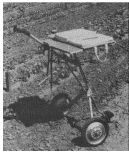
Figure 2.—Golf cart tally board.

of metal and to the top of the cart handle by a bent 1/8-inch metal strip screwed to the underside of the writing surface. Both metal connections are fastened with wing nuts for easy dismantling