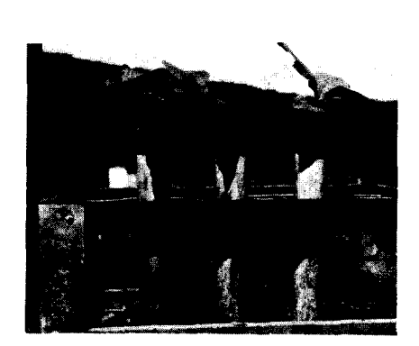
Figure 2.—Red oak tubelings.