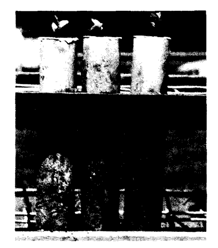
Figure 4. —Yellow-poplar tubelings.