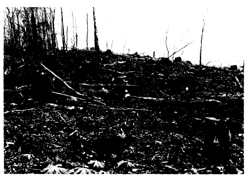
Figure 1.—General view of red oak/black cherry area before planting.

All bare-rooted seedlings were 1—0 stock; they were planted with a shovel in early April. Red oak