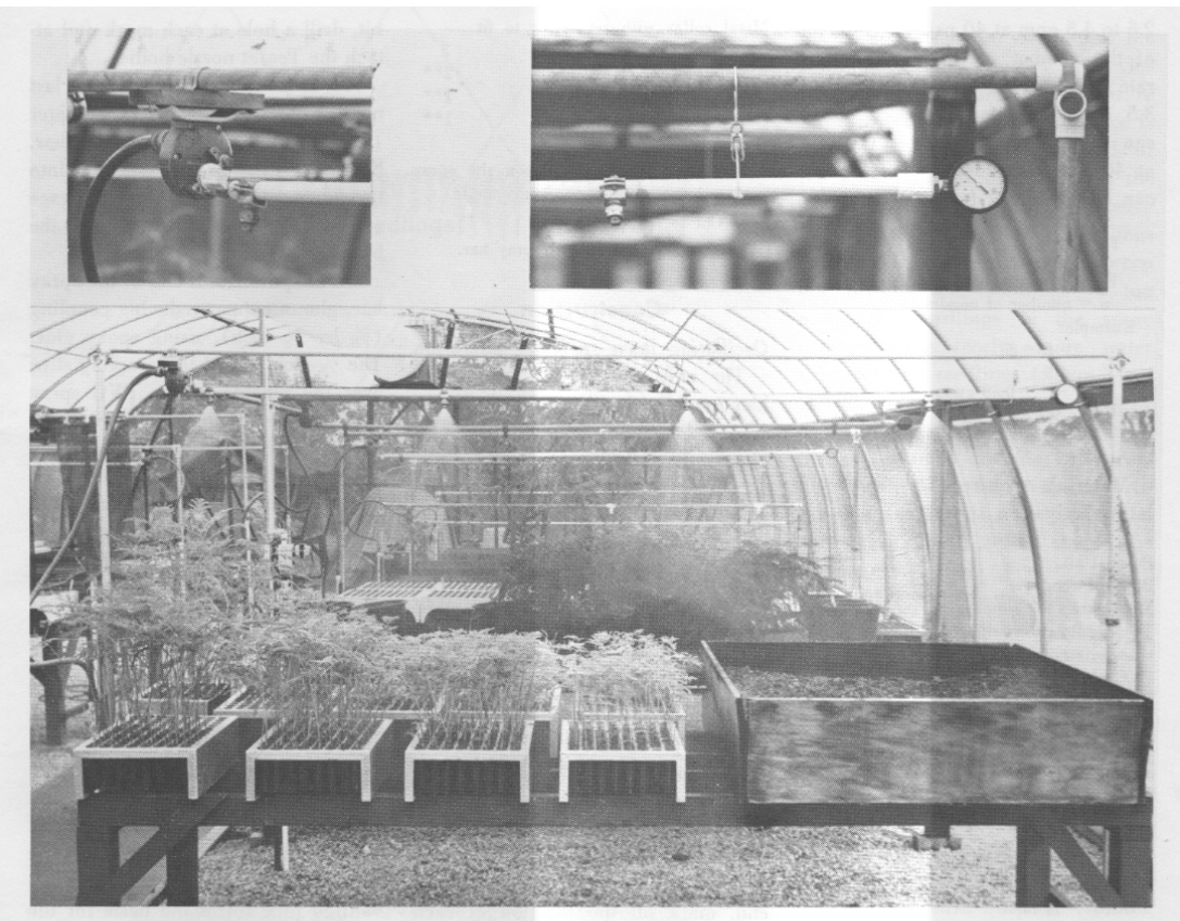
Figure 1.-An easily-built, inexpensive oscillating irrigation sprayer provides for uniform and accurate application of water and fertilizer in small nurseries.