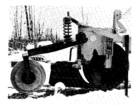
Figure 1.-Side view of planter resting on stand and trencher resting on a cement block covered with snow.

Our Wildland tree planting machine coulter, (2) a trencher, (3) an operator's seat, and (4) a packing wheel.