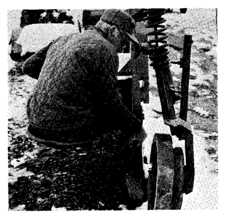
Figure 2.-Rear view of planter showing width of trencher; also the position, size, and shape of the packer wheel.

functions: 1) It provides downward draft on the trencher so that it penetrates all of soil from the lightest sand to the heaviest clay; 2) it reduces friction with the soil to a minimum, permitting this planter to be pulled by a light twoplow' tractor (about 30 H.P.) without chains. (The parallel sides of the trencher also contribute to reduced friction with the soil and resultant light draft); 3) having a very gradual pitch on the front of the trencher creates a considerable opening between the upper front of the trencher and the coulter (fig. 1), thus permitting easy cleanout of the roots or trash that may occasionally become lodged. on the front of the shoe or trencher.