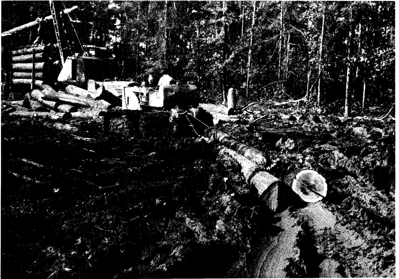
Figure 1.—Severe soil disturbance on this log deck resulted from use of skidding equipment on a medium-textured soil at high moisture content.

roots entered cracks in the cores. The recovery process was much slower for compacted cores buried in the forest than in open areas, possibly the result of less moisture and less pronounced temperature changes in the forest.