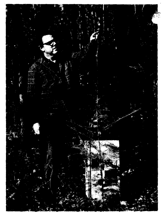
Figure 2.—Height growth of underplanted Japanese larch after treatment of competing hardwoods with pellet fenuron herbicide.

<sup>2</sup> Percent crown defoliation is here defined as an ocular estimate of the proportion of total crown per tree or shrub defoliated.