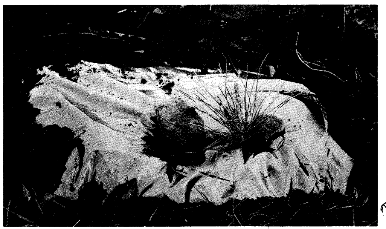
Figure 1.—Jeffrey pine mulched with black polyethylene. A stone at each side of center slit holds plastic down. Edges are buried.

amount of terminal elongation was measured at the end of each year on the surving trees.