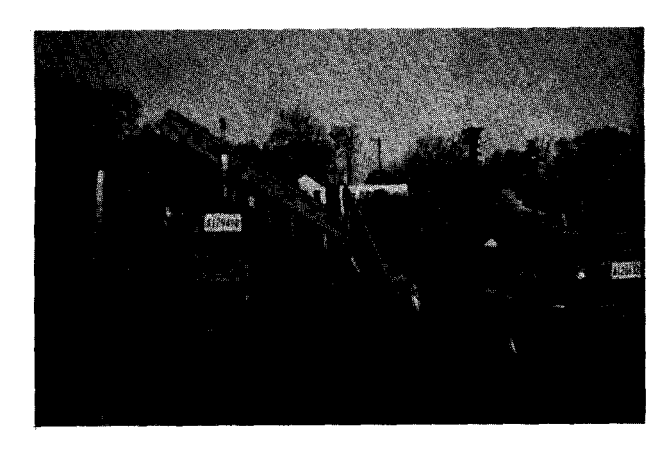
Figure 2.—Mulch pickup in action, pulled by tractor at right. Tractor at left is pulling hayrack, which is loaded from side elevator from pickup. Mulch from paths is first rolled onto beds. Instant depth control by hydraulic enables operator to pick up all but the fine mulch, which is left on the beds.

and which would operate in confined areas.