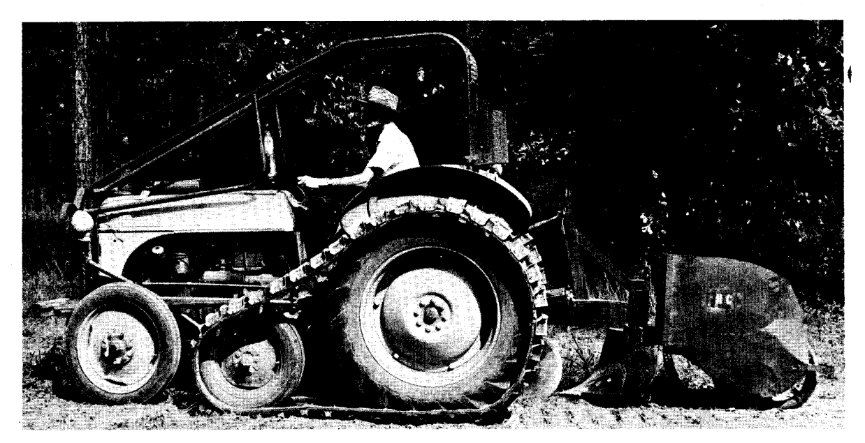
Figure 2.—In the compact H–C seeder, the scalper, bedder, sower, and packer are all in one compact unit which can be attached to any tractor with a standard three-point hitch. It is good for small open areas.

Before deciding whether to try furrow seeders, a land manager should know how they work, how models differ, and what precautions must be taken in using them.