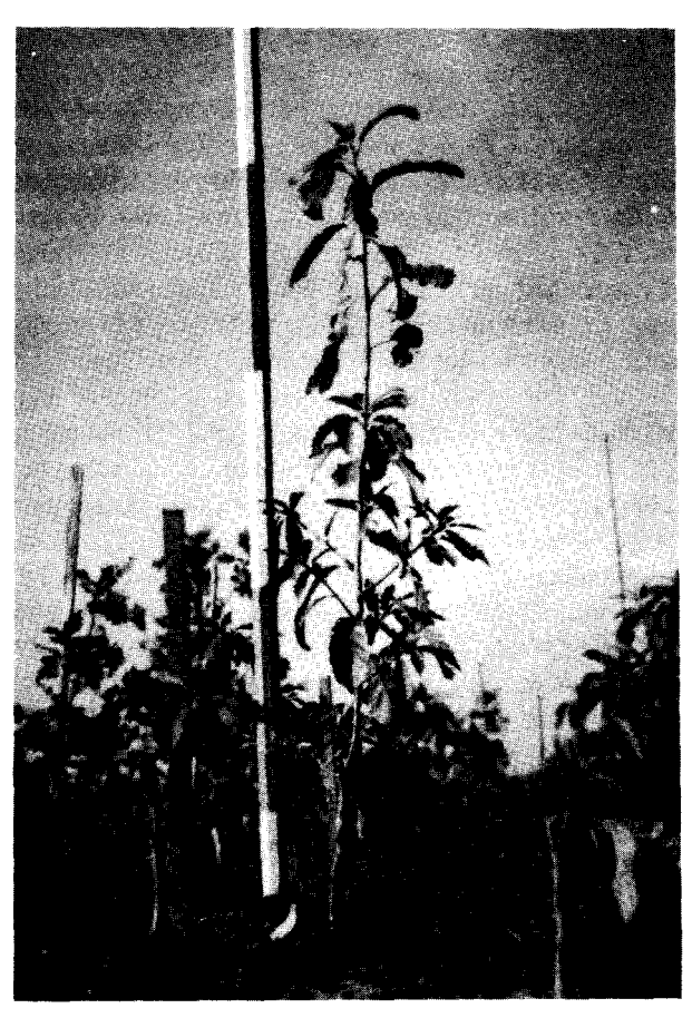
Figure 3.--Chestnut oak side-grafted in the field (1-year growth).

One other technique is helpful in both field and bench grafting. If the scion begins growth too soon after grafting, the graft will usually fail. The transport system between rootstock and scion is not well enough developed to