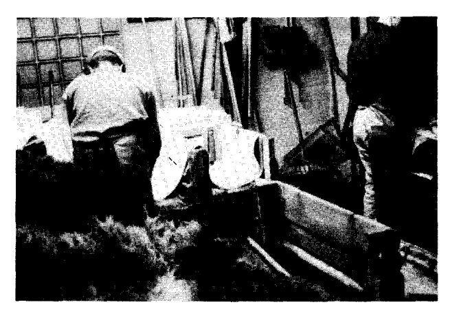
Figure 2.--In packaging, a layer of dry Seedling Pak blanket is placed on the inside of the paper wrapper.