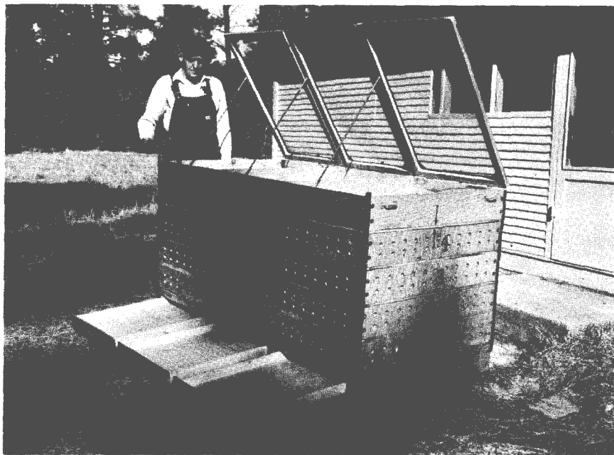
Figure 1.--Drying trays assembled. Angle irons at corners hold the complete rack together. The screened lids are hinged. The rockers at the ends of the bottom tray permit the cones to be agitated.

Each tray has three separate compartments so three different species of cones may be dried simultaneously. Each compartment holds approximately 3/4 to 1 bushel of green cones.