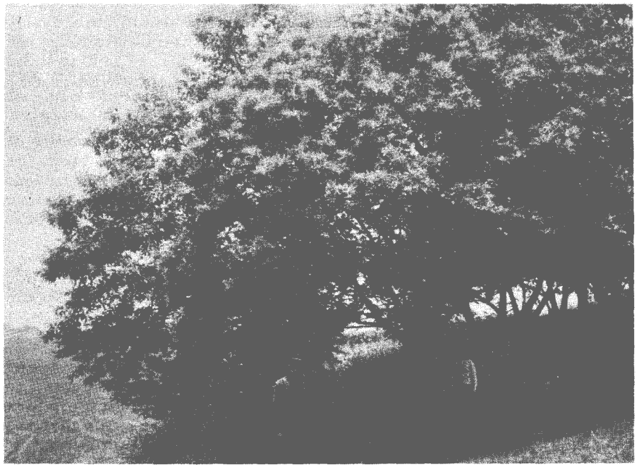
Figure 2.--Another West Virginia farmer, with his grandson, and the row of Asiatic chestnuts which he planted 20 years ago. These trees are each year bearing increasingly heavier yields of nuts. His only regret, "I wish someone had told me to plant these trees farther apart".