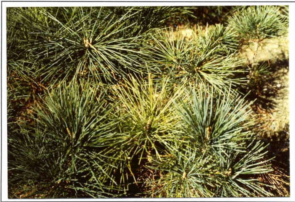
Figure 2. Chlorotic plug+2 western white pine transplant (center) surrounded with healthy (non-symptomatic) transplants at the USDA Forest Service Nursery, Coeur d'Alene, Idaho.