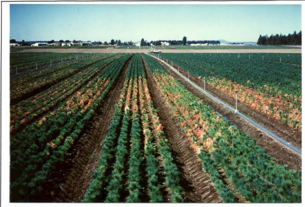
Figure 1. Plug+2 western white pine transplant mortality at the USDA Forest Service Nursery, Coeur d'Alene, Idaho. Note concentrations of mortality.