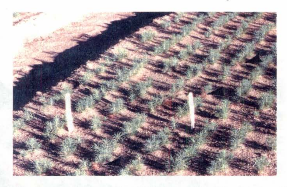
Figure 2. Borders of subplots (white pot labels) used for determining seedling emergence, first-year survival, and level of disease within pre-plant treatment plots - USDA Forest Service Lucky Peak Nursery, Boise, Idaho. Seedlings with postemergence disease are indicated by arrows.

within each replicate plot were placed on Komada's medium and isolated organisms were identified as described above for soil samples.