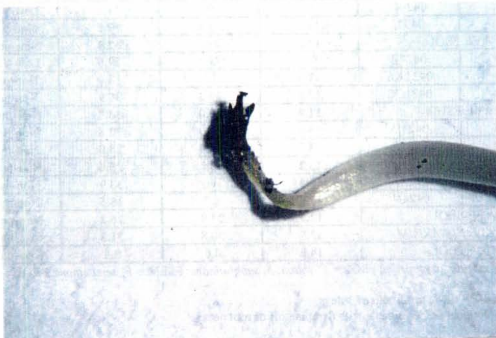
Figure 2. Douglas-fir germinant root decayed by Fusarium oxysporum obtained from Acacia koa after exposure to the fungus for 7 days.