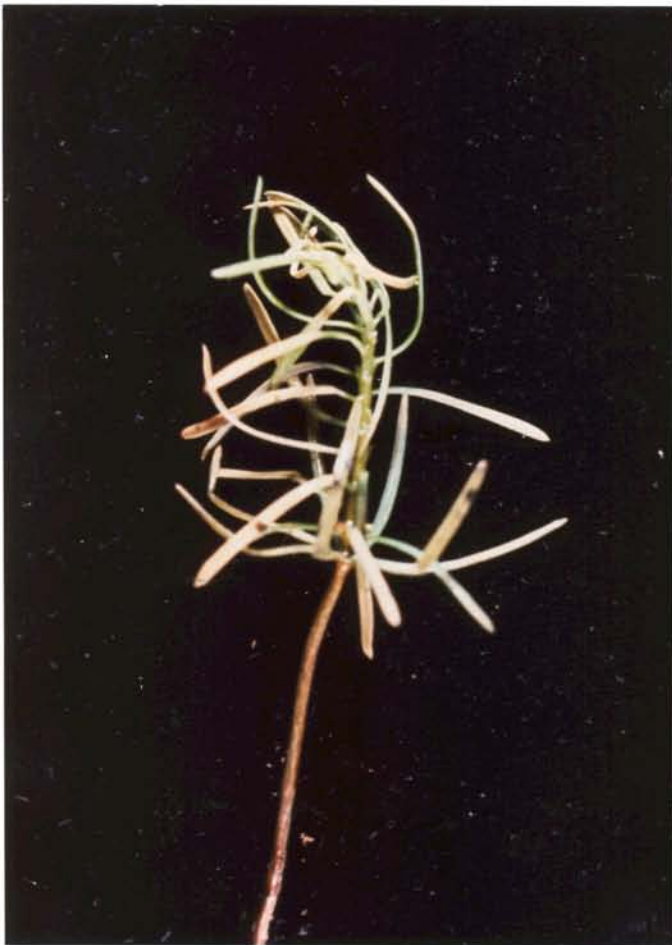
Figure 1.--Containerized grand fir seedling with foliage symptoms resulting from root infection by Fusarium avenaceum at the North Woods Nursery, Elk River, Idaho. Foliage initially appeared grey and water soaked and later turned brown.

Recent investigations were conducted to evaluate mortality of containerized grand fir ( Abies grandis (Dougl.) Lindl.) seedlings being grown at the North Woods Nursery in Elk River, Idaho. Affected seedlings had foliage that had turned grey in color and appeared water soaked (figure 1). Foliage symptoms developed first at the base of seedlings and then extended upward throughout the crown. On several seedlings, white-orange sporodochia (fungal structures that produce spores) were found just above the groundline on the main stem (figure 2). These sporodochia were reminiscent of those produced by Fusarium spp., common pathogens of containerized seedlings.