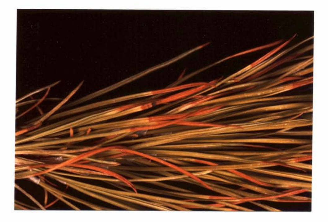
Figure 1.--Needle tip dieback of 2-0 ponderosa pine seedling produced at the Coeur d'Alene Nursery. Necrotic tips were usually colonized by Lophodermium nitens and several other secondary saprophytic fungi.