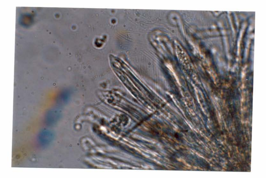
Figure 3.--Photomicrograph of asci intermingled with slightly longer hooked paraphyses (x450). Asci are clavate to cylindrical and contain eight filiform ascospores which are forcibly released, windborne, and cause needle infection.

Fungal infection of needle tips did not affect first season survival of transplanted seedlings (table 1). Although several seedlings died, they were not killed by needle fungi. Rather, their roots were dead and were probably injured or desiccated prior to transplanting.