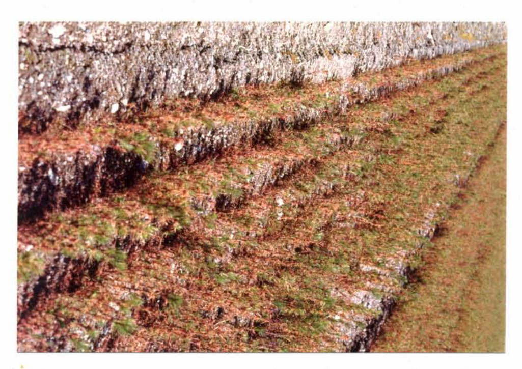
Figure 1.--Bareroot western larch seedlings with severe infection by Meria laricis at the USDA Forest Service Nursery, Coeur d'Alene, Idaho.

Microscopic examination (100-450X) of these sporulating structures indicated that they were of the fungus \underline{\text{Meria}} \underline{\text{laricis}} \underline{\text{Vuill}} . Examinations of many affected seedlings indicated that \underline{\text{M}} . \underline{\text{laricis}} was most frequently associated with disease symptoms and likely the major cause of the malady.