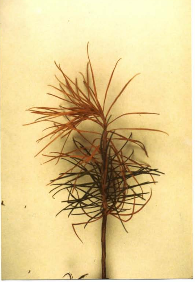
Figure 2. Top necrosis of container-grown ponderosa pine seedling from the Colville tribal greenhouse. Necrotic needle and stem tissues were frequently colonized with Phoma glomerata and root systems colonized with Fusarium spp.

Figure 1. Top dieback of containergrown western larch seedling from the Colville tribal greenhouse. Necrotic tips were usually colonized with Botrytis ci nerea .