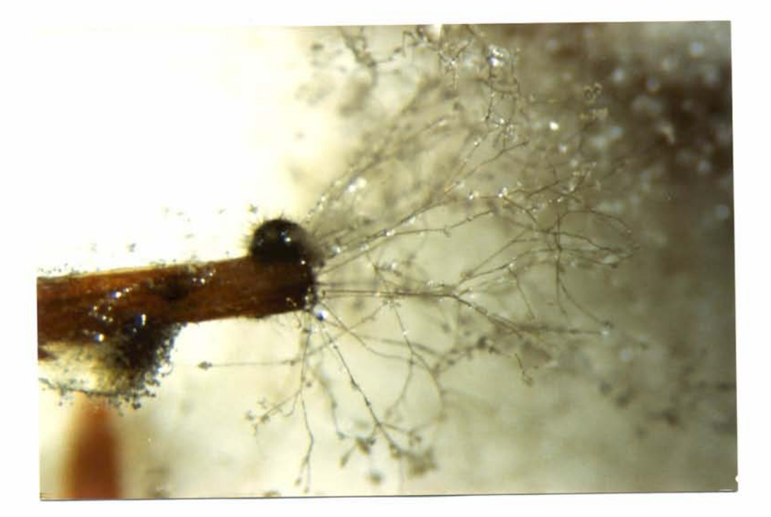
Figure 4. Botrytis cinerea sporulating from tip of a necrotic western larch needle incubated within a moist chamber. Prominent grayish-colored conidia were produced at the end of black condiophores.

Engelmann spruce seedlings from both crops had roots infected with Fusarium spp. and C. destructans . No foliar pathogen was associated with crown dieback symptoms. Root infection levels and root deterioration ratings were higher in the 1992 crop (compare Tables 2 and 4). The most common Fusarium spp. isolated from roots of 1992 seedlings was F. anthophilum (A. Braun) Wollenw., a species not previously obtained from conifer seedlings in the northern Rocky Mountains. Other species isolated from spruce roots included F. proliferatum (Matsushima) Nirenberg, F. oxysporum , F. acuminatum Ell. & Ev., F. sporotrichioides Sherb., and F. avenaceum (Fr.) Sacc. All of these species have previously been encountered on container seedlings (James and others 1989b; 1991b), although not all are necessarily pathogens. The role of F. anthophilum in causing disease is unknown since pathogenicity of this species on conifer seedlings has not been tested.