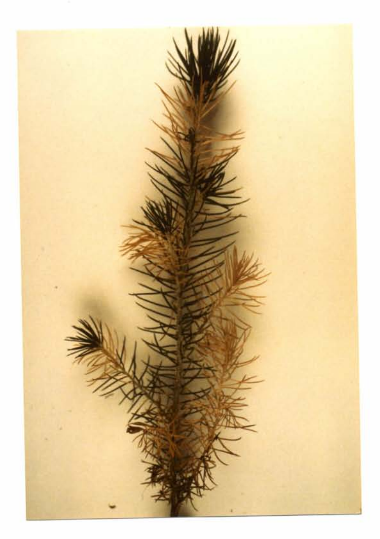
Figure 3. Foliar necrosis of container-grown Engelmann spruce seedling from the Colville tribal greenhouse. Necrotic patterns were not restricted to the tips of main stem or lateral branches as was common on wester larch and ponderosa pine. Rather, a mosaic of necrotic needles were common throughout the crown. Diseased seedlings were extensively colonized with Fusarium spp.