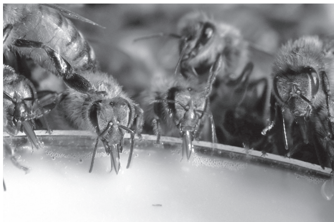
Figure 1. Bees feeding on a special diet formulated by the USDA-ARS. Honey bee die off may be caused by a combination of poor nutrition, pesticide exposure, pests, or pathogens. Honey bee colony rental is becoming increasingly expensive despite recent progress in understanding and mitigating honey bee stressors. (Photo: Stephen Ausmus USDA-ARS).

The amount of land hosting diverse floral resources in the few hundred meters surrounding a flowering crop is directly related to pollen deposition (Kremen and others 2004). Additionally both