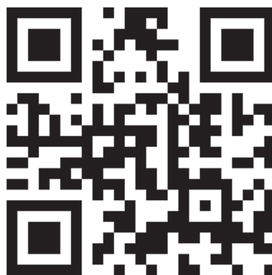
Figure 1. A sample quick response (QR) code.