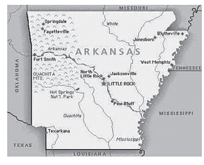
Figure 2. State of Arkansas map.