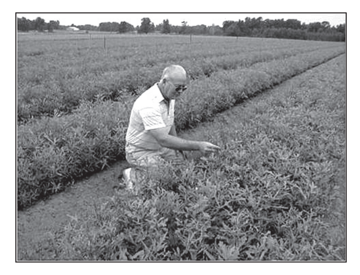
Figure 3. Weyerhaeuser Magnolia Nursery hardwood seedling crop.

The Magnolia Nursery (Figure 3) was founded in 1972 as the company was gearing up to reforest Arkansas operations. Since its inception, the nursery has grown 1.9 billion seedlings of various species and has developed a seed extraction and processing lab on site. They are currently growing approximately 50 million pine species, as well as 2.5 million hardwood species. The hardwood species are grown for outplanting on company lands as well as for sale to other parties for both the Wetlands Reserve Program and the Conservation Reserve Program.