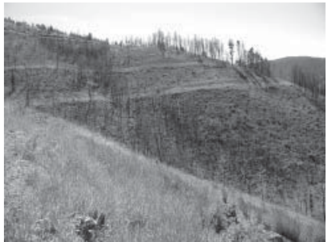
Figure 4 —Jammer road rehabilitation, Bitterroot NF.

Seeding Along Wilderness Trails —Selected trails in the Bob Marshall Wilderness, on the Flathead National Forest in northwest Montana, were hand-seeded to reduce