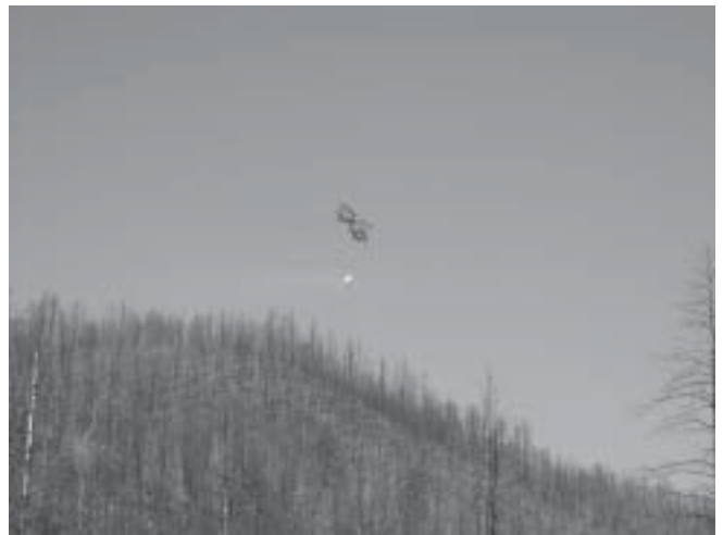
Figure 3 —Aerial seeding native grass species on the Black Mountain Fire, Lolo NF.

macrourus ) and slender wheatgrass ( Elymus trachycaulus ), which are both native.