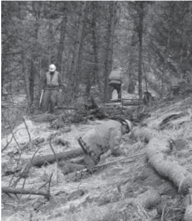
Figure 5 —Revegetation of access roads, Bitterroot NF.

erosion where trail sloughing was anticipated and to reduce noxious weed invasion after the wildfires in 2000 (Figure 6). On a portion of the trail within the Helen/Lewis II Fire area, blue wildrye ( Elymus glaucus ) was hand-seeded; the seed source was about 20 mi (32 km) from the seeding project. Mountain brome ( Bromus marginatus ) was also used on other trails. Monitoring will continue to determine success of seed germination, native plant recolonization, and effectiveness in reducing erosion and invasion by noxious weeds.