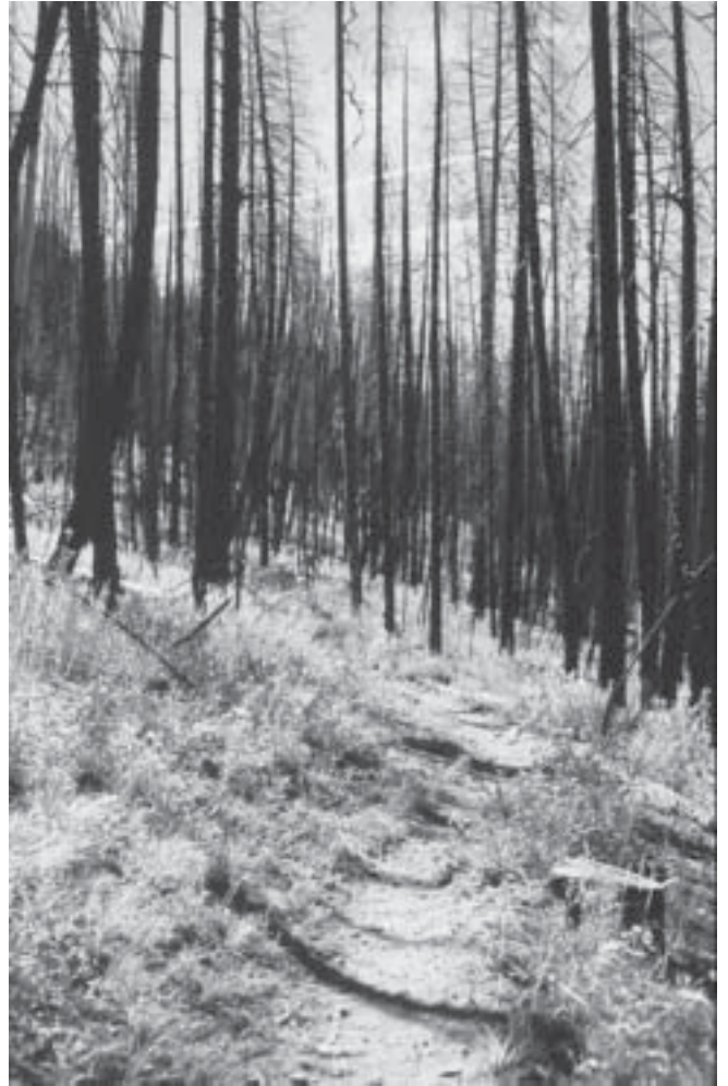
Figure 6 —Grass establishment following seeding of native species in 2000 (A—2000, B—2001, C—2002) in the Bob Marshall Wilderness, Flathead NF.