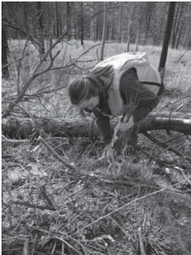
Figure 2 —Handcutting snowberry ( Symphoricarpos albus ) to produce rooted cuttings, Bitterroot NF.

Jammer Road Obliteration —Jammer roads resulted from the short line, high-lead logging systems of the 1950s through the 1970s. Fire restoration has provided an opportunity to obliterate these old jammer roads to restore hydrologic function and plant cover. One example is the road rehabilitation on the Bitterroot National Forest (Figure 4). Snowberry ( Symphoricarpos albus ) container seedlings were among the species planted on the roads; the seedlings were cultivated from cuttings collected locally (Figure 2). Ponderosa pine is planted in the harvest area. The entire area was aeri-ally seeded with thickspike wheatgrass ( Elymus