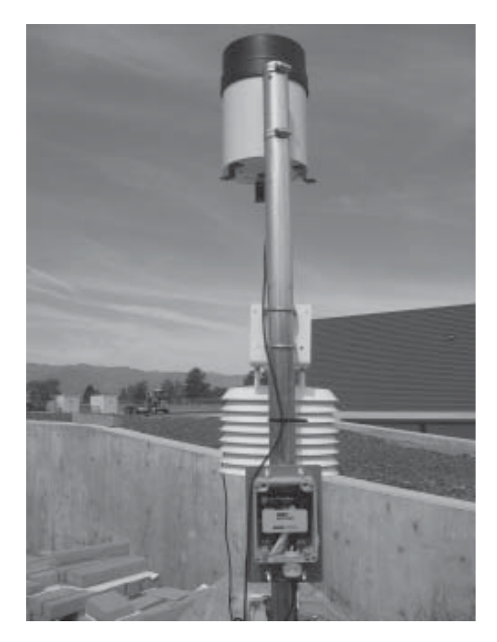
Figure 1—Downloading data is relatively easy on these low-cost weather stations.

Measuring weather at project locations is of interest to researchers, incident managers, and to anyone who needs to keep track of site-specific weather conditions. As part of the Remote Data Collection project, MTDC is evaluating low-cost weather instruments that have data logger capabilities (Figure 1). We purchased 2 different systems for U.S. $600 and U.S. $1,300, and plan to evaluate them.