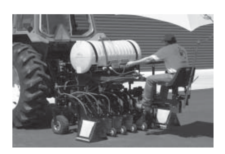
Figure 3 —MTDC's improved shielded herbicide sprayer is being evaluated in Virginia.

The Bitterroot and Idaho Panhandle National Forests evaluated several synthetic fabrics in 2004. DuPont Sontara<sup>™</sup> absorbent fabric worked the best, and MTDC located a supplier, American Supply Corporation, that agreed to custom cut the fabric into 22 in (56 cm) wide rolls, 200 yd (183 m) long, for tree wrapping applications. Contact Brian Vachowski for more information.