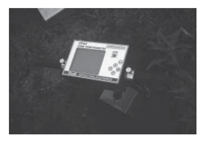
Figure 2 —New-generation soil penetrometers are easy to use, and save readings for further analysis back at the office.

Weeds are difficult to control in hardwood nursery beds. Chemicals such as Roundup<sup>™</sup> kill the weeds, but also kill the seedlings if the spray is misdirected. Several nurseries have fabricated shielded sprayers to prevent herbicides from being applied to the hardwood seedlings. MTDC was asked to review this existing equipment, select the best features, and incorporate those features into a new prototype model.