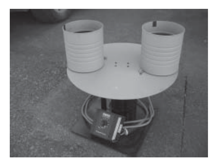
Figure 4 —This whitebark pine seed scarifier is being evaluated at the USDA Forest Service Coeur d'Alene Nursery, Idaho.

Duff in seed orchards harbors insect larvae over winter. Starting with a machine designed to sweep golf courses,