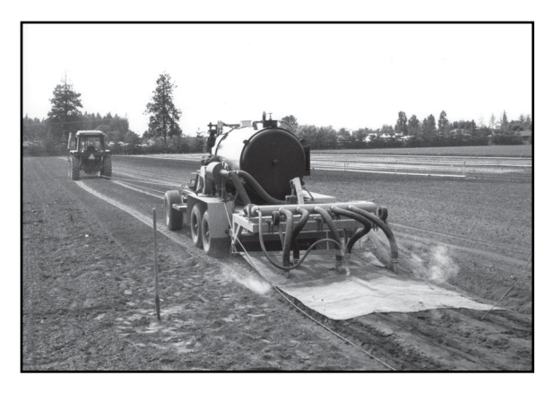
Figure 4. MTDC developed this prototype machine to inject steam into nursery beds, sterilizing the soil as an alternative to using pesticides. It proved to be too slow for production use.

Looking at an older technology still used in Europe, MTDC built a prototype steam treatment machine for treating nursery beds. If soil is heated to at least 160 °F (71 °C) for 20 minutes, tree seedling pathogens are killed, while desirable microorganisms survive. MTDC's steamer featured a 1-million BTU (293 kw) boiler that has been outfitted to inject steam into the soil at about 8 inches (20 cm) deep (fig. 4). Field