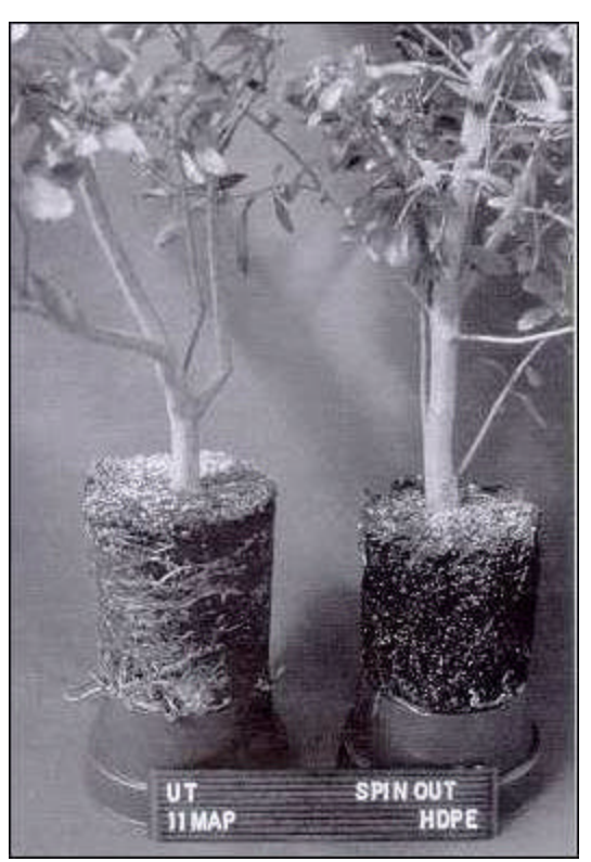
Figure 2. Waxmyrtle (Myrica cerifera) arown in Spin Out-treated polybaas