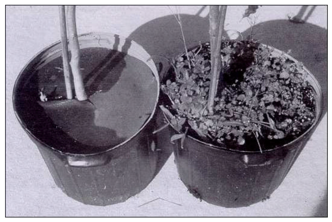
Figure 3. Tex-R Geodiscs used for weed control in nursery containers.