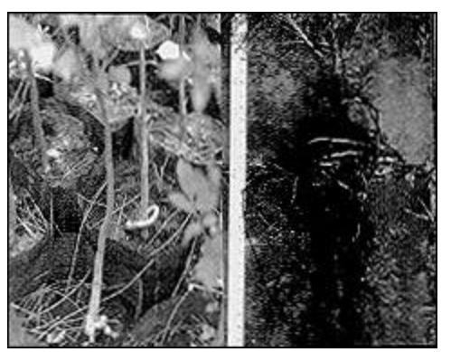
Figure 3. Examples of root spiraling caused by polybag production system. Left: Spiraling evident after transplanting from small bag; Right: Spiraling evident after excavation from plantation.

Another concern with polybag seedlings is root spiraling (Josiah and Jones 1992). Seedlings with encircling lateral roots will eventually strangle and die or topple. However, spiraling roots is not a common occurrence in seedling root systems. It may occur only when seedlings are held more than one year in the same polybag. Most seedlings suffer from root deformation following pricking out or poor R/S ratio caused by the taproot escaping the bag (Figure 3).