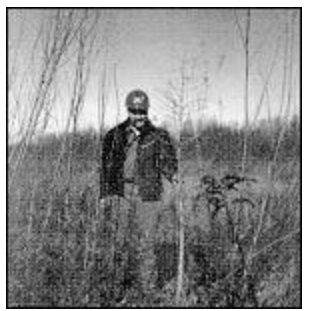
Figure 15. One of the test trees planted on No. 7 Pond in 1974. This is one of the same trees shown in Figure 16 twenty years later. (The late Joseph Green did much to support the early work with trees.)

They are growing rapidly as examples of what can be expected from the 3,500,000 trees planted on our tailings ponds. In the years to come the Cypress Garden will surely become a show place.