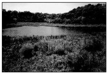
Figure 9. No. 12 Pond in early 1992. Note the small trees at the water's edge and use the hills for reference in the next picture.

Figures 9 and 10 compare the growth of trees on No. 12 Pond during the period from May, 1992 through May, 1995. Again the growth has been spectacular. No. 12 Pond also faced a drainage problem. In this case the top water flume could not easily be lowered. A new drainage system was cut through the stones to the left of this picture. The hydrolytic loading of the dam should be diminishing as the trees grow larger and stabilize and dehydrate the waterlogged soils below.