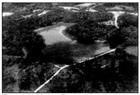
Figure 5. No 12 Pond as an active pond.