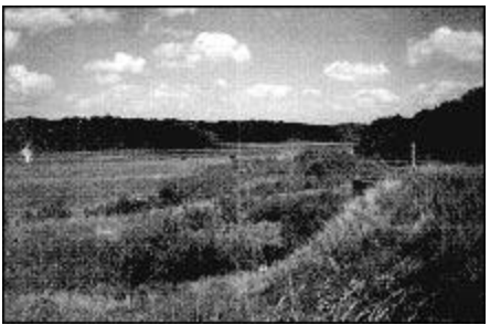
Figure 14. The view of No. 15 Pond in May, 1995. Note that all water in this part of the pond has been drained.

Planting of No. 15 Pond is almost complete although planting is planned for the winter of 1997. Any areas where there have been tree losses will be planted and a new spillway is being installed to lower the water level of the pond and control what is left in the pond. As the trees age in this pond there should be only a small stream across the top of the pond. There are know to be subterranean springs buried in the muds of No. 15 Pond. It is difficult to predict which flow path these springs will eventually take. Since the springs are located in the wall of the pond it is likely that they will eventually surface near the old shore line of the pond. It is very unlikely that they should cause any problems once the tap roots of the cypress trees become established and should be helpful to water the large trees.