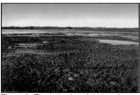
Figure 3. The behavior of drying clays in No. 15 Pond to prepare it for planting.

No. 15 Pond was first drained in 1989. Other ponds had been drained much earlier. Figures 3 shows the results of draining No. 15 Pond. It is also worth noting the nature of the clay as is freezes and thaws and dries. Judging from past experience, the concentration of the top lumps are about 30% solids or less. This is another example of the contraction of the clay as water is removed. It points up how much of the volume of an abandoned pond is occupied by water. Figures 4 and 5 show Ponds 15 and 12 before they were drained.