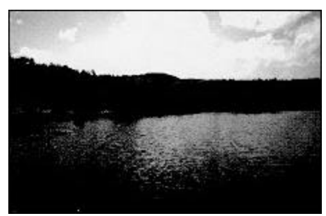
three years after the picture shown in Figure 7.

Figure 8 is almost the same picture of No.9 Pond as was Figure 7. Figure 8 vividly demonstrates what only three years growth can bring to the cypress tree sizes. The trees are performing splendidly. It is expected that the shallow water in No.9 Pond will eventually be replaced with silt and that the cypress trees will seed new growth themselves. At this time there seems to be no need to either plant more trees or to thin those that are currently growing. The process should take cared of itself leaving a Figure 8. No. 9 Pond in May of 1995 grove of cypress trees with perhaps a small stream through it for a few years. All water to this pond is run off from the surrounding land.