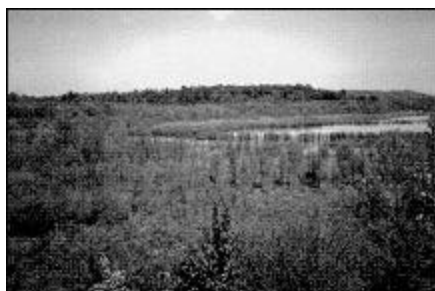
Figure 11. No. 7 Pond in 1992 showing the planting at the water's edge.