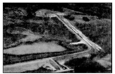
Figure 6. No. 7 Pond when it was drained for tree planting experiments. (Note: The large trees to be discussed later were planted on the drained part of No. 7 Pond far to the left of the picture.

Figure 6 shows No.7 Pond after it was drained to plant trees in the lower end of the pond. Unfortunately the drain pipe for this pond collapsed when the pond was first filled and the drain was grouted closed with concrete. The original drain pipe can be seen as a light colored spot at the end of a short road on the far right side of the picture. This is a road leads from the road on top of the dam. The collapse of the drainage pipe required the construction of a deep drainage ditch to rid the pond of most of its water. This ditch can be seen as a straight line leading from the water's edge to near the top of the picture forming a "V" with the light colored road on top of the dam.