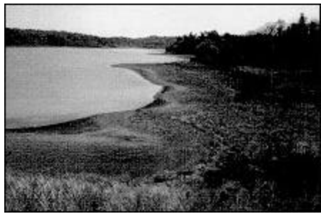
Figure 13. The view of No. 15 Pond in May, 1993. The photograph was made from the tower seen in Figure 15.

Figures 13 and 14 demonstrate the progress achieved with No. 15 Pond. The pond is much too large to give more than a very selected view. The size of the pond has shrunk dramatically since 1992 until 1995. Note the planting lines as the following years grow is smaller than the year before. The spacing is almost perfect. The water level on this pond has been controlled to keep down grasses that will choke light from young trees.