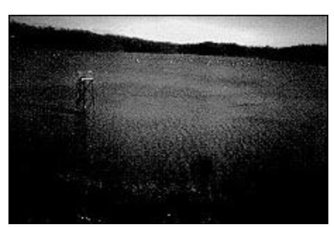
Figure 4. No. 15 Pond as an active mountain lake.