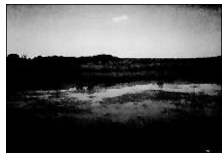
Figure 7. No. 9 Pond in the early days of planting in May 1992.

Figure 7 shows trees planted in No.9 Pond. No.9 Pond is very small and shallow. Trees have grown well in this pond even though many were planted in water and remained in water. The progress of the growth can easily be seen in Figure 8 which is three years growth of the trees from Figure 7. Note the hill in the background for reference.