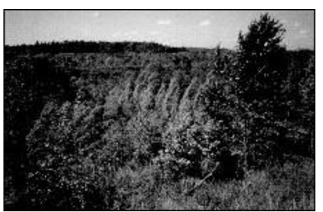
Figure 12. No. 7 Pond three years after figure 11. June 1995.

Figures 13 and 14 demonstrate the progress achieved with No. 15 Pond. The pond is much too large to give more than a very selected view. The size of the pond has shrunk dramatically since 1992 until 1995. Note the planting lines as the following years grow is smaller than the year before. The spacing is almost perfect. The water level on this pond has been controlled to keep down grasses that will choke light from young trees.