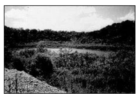
Figure 10. No. 12 Pond in May 1995 showing three years of growth from Figure 9.

Figures 11 and 12 show the growth of trees on the wet end of No.7 Pond. Tree growth on this pond has far exceeded expectations and is a picture perfect example of what was desired. There was never great concern for stabilizing the soil in this pond for dam protection. There was the concern to dry up the waterlogged slimes in the depths of the pond to prevent the danger of breaking through the dried crust of the pond. As mentioned earlier there was a drainage problem with No.7 Pond also, but it is believed that this problem has been satisfactorily solved. Additional planting as the system dries could be of benefit, but the trees should seed the new growth and silting in should be rapid in this location.